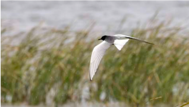
Apparent White-winged Tern, 28 Apr 20, Dare Co, NC.

White-winged Tern: Pending review by the NC BRC is the report of an apparent adult