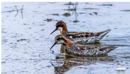
Red-necked Phalaropes, 22 May 20, Wake Co, NC.