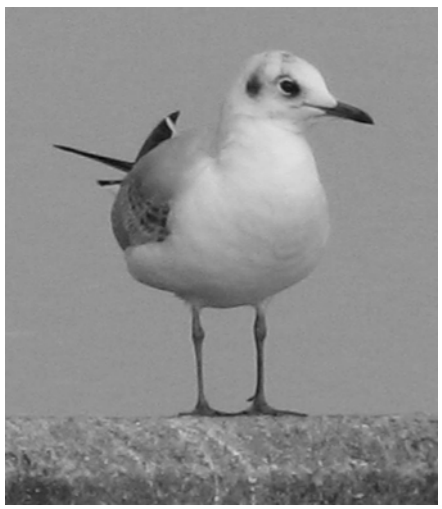
Black-headed Gull, L. Mattamuskeet, NC, 22 Feb 2007.