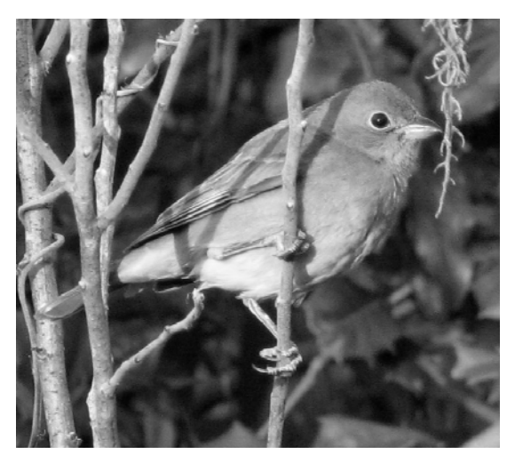
Painted Bunting, Manteo, NC, 31 Jan 2007.

YELLOW-HEADED BLACKBIRD: A male Yellow-headed at the Pungo Unit of Pocosin Lakes NWR, NC 4 Feb (Lex Glover) was the only one mentioned this winter.