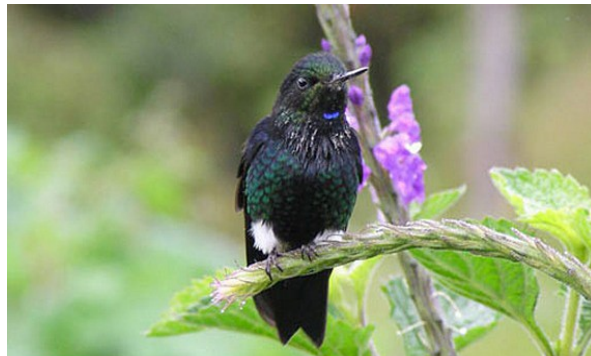
Black-breasted Puffleg.