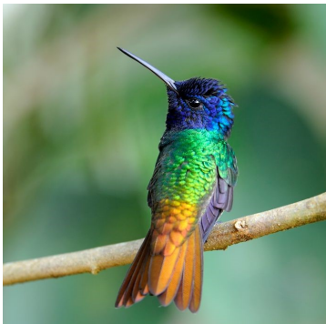
Golden-tailed Sapphire.