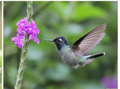
Violet-headed Hummingbird.