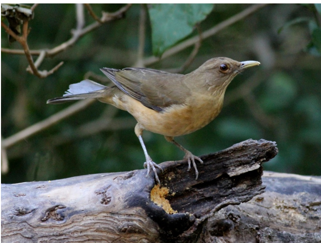
Clay-colored Thrush.

On Wednesday, we drove west to our first stop, Estero Llano Grande State Park in Weslaco. One highlight was seeing a Common Pauraque from less than ten feet, at its yearly roosting spot. We picked up Cave Swallow, Clay-colored Thrush, Black-chinned Hummingbird, Curve-billed Thrasher and McCall's subspecies of Eastern Screech-Owl. We visited three sites in the hot afternoon, but our only western species added was Altamira Oriole. Our evening finished at 166 species.