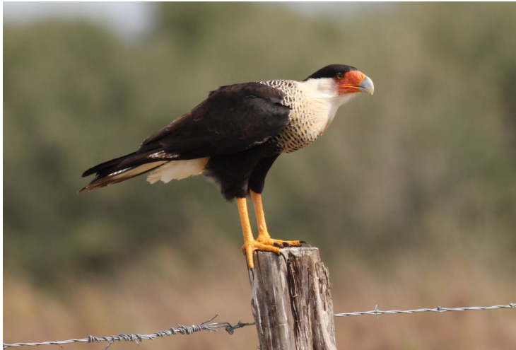
Crested Caracaras.

Eight of us arrived in San Antonio on Friday, November 10th. A walk around the block got us the common Great-tailed Grackle and White-winged Dove, but we also found our first Ladder-backed Woodpecker by the hotel. Leaving early on Saturday, we headed for the coast. Once we got off the interstate, we made a few roadside stops on our way to Choke Canyon State Park. Several Crested Caracaras and Harris's Hawks were seen, along with Great Kiskadees.