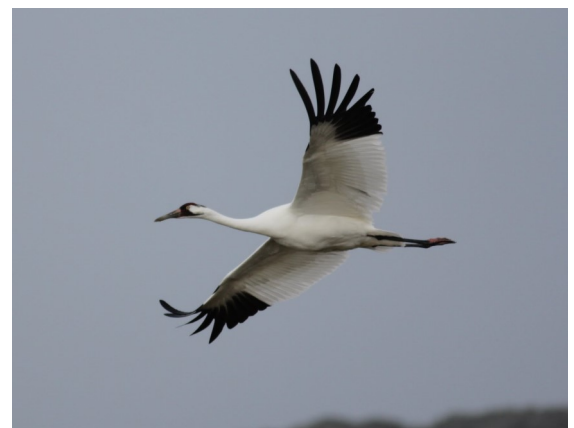
Whooping Crane.