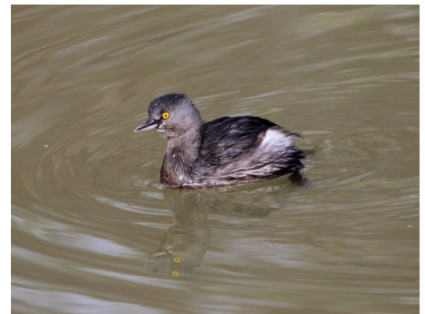
Least Grebe.

At the park, we got most of our ducks and