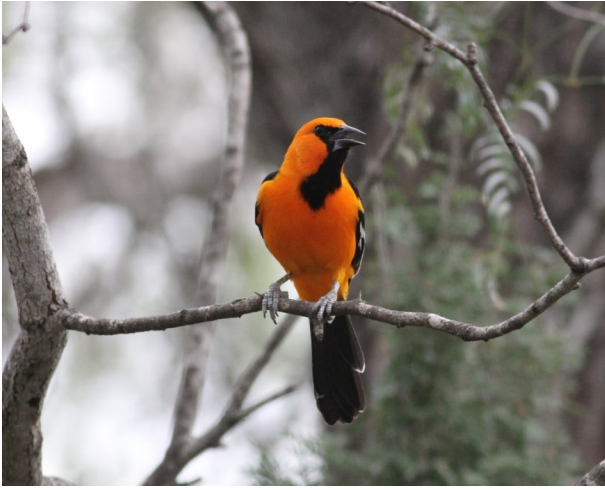
Altamira Oriole.

A two-mile walk at Bentsen-Rio Grande State Park started our Thursday morning. We added Olive Sparrow, Black-crested Titmouse, Black Phoebe and got much better looks at a Gray Hawk, adult and juvenile. At Anzalduas County Park, we had a Ringed Kingfisher and, in Hidalgo, we saw six Monk Parakeet nests, with birds. There was just one nest five years ago, so they are doing well, as many non-native species tend to do. After one other stop, we finished at an evening roosting area for thousands of birds in McAllen. The main one we wanted was Green Parakeet. Around 300 showed up, along with Grackles, Starlings, Cowbirds, Pigeons and one Merlin, not sure which direction to try. The birds on the wires stretched for blocks in