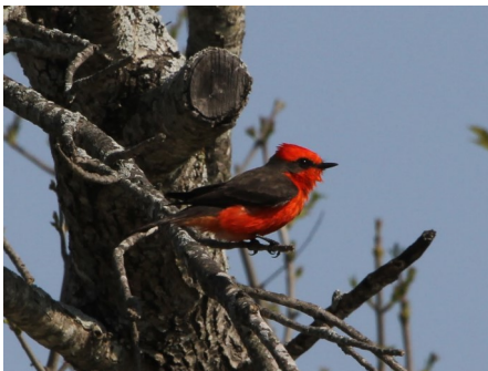
Vermilion Flycatcher.

waders, along with Least Grebe, Neotropic Cormorant, Golden-fronted Woodpecker and Vermilion Flycatcher.