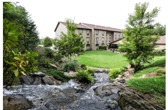
Mountain Lodge and Conference Center

Check-in begins at 3pm and check-out is at 11am. The room rate is $109 per night plus taxes, and includes a complimentary hot breakfast in the Fireplace Lounge each morning of your stay. The CBC rate is good for studio suites (two full beds or king bed with full kitchen) or one bedroom king suites (king bed with separate living room with sleeper sofa and full kitchen). The venue also offers an indoor pool, fitness center, free WiFi and daily housekeeping. There are a wide variety of restaurants within a short drive in Flat Rock and nearby Hendersonville.