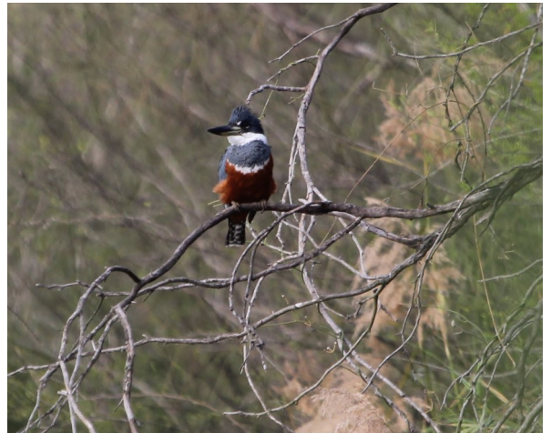
Ringed Kingfisher.

Driving west on Friday morning, we got out of the endless city which the valley has become, not knowing where one city starts and another stops. It was good to get back into the country. Our first stop was Roma Bluffs, where we looked across the Rio Grande into Mexico. Sadly, an Audubon's Oriole sang a few times down the bluff, but was never seen. We added a Verdin at Salineno. No new western birds at Falcon State Park or Zapata. At San Ygnacio, we saw around ten White-Collared Seedeaters in the reeds, all young males or females. Viewing was very brief as they flew from cover to cover. Finally one sat up for several minutes for a great view. From there, we drove to Laredo for our lodging, with 183 species.