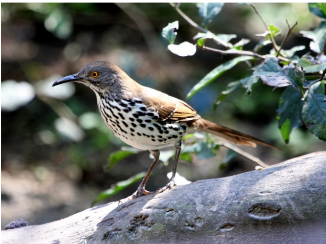
Long-billed Thrasher.