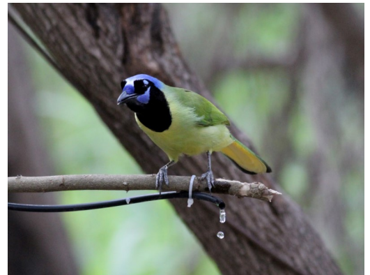
Green Jay.

After a fabulous lunch at Mary's Mexican Cafe in Rio Hondo, we birded Laguna Atascosa National Wildlife Refuge, adding Long-billed Thrasher, Plain Chachalaca and Greater Roadrunner. A "lost" Lazuli Bunting that had been reported there was seen by most of the group. After stopping on South Padre Island, we stayed in Brownsville, with 130 species under our belts.