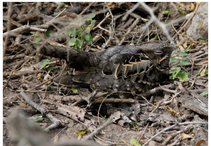
Common Pauraque.

We drove Old Port Isabel Road until the holes started getting the size of the van. It's a good area for Aplomado Falcon. A falcon was seen 200 yards or more away. The size was good, so we walked down the railroad tracks to get closer. Oddly enough, the closer we got, the smaller it got. I guess the heat waves made it look bigger. In the end, it was a Kestrel, not even close to Aplomado size. Highway 100 has a hacking box from which Aplomado Falcons are released. It's usually a good spot as they often stay in the area. After some time, one flew behind us that most got to see. We finished the evening at Oliveira Park, where Red-crowned Parrots roost for the night. There were about 250, screaming as they came in and flying around us. Tuesday finished with 150 species and another night in Brownsville.