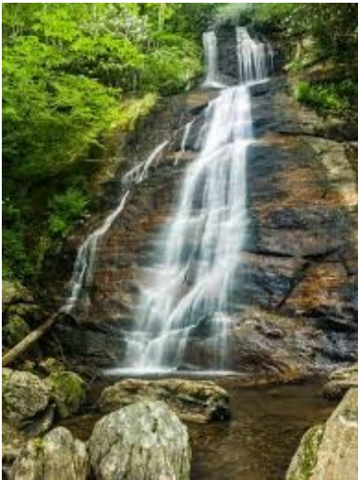
Pisgah National Forest (USDA)

Choose trips from some of the most favored hotspots in the southern Appalachians including the Blue Ridge Parkway, the Pisgah National Forest and the Blue Ridge Escarpment, the Green River Gamelands, and a variety of local parks and greenways. Along the escarpment find some birder favorites like Swainson's, Kentucky, and Worm-eating Warblers, and at higher elevation sites in the forest and along the parkway Cerulean, Canada, Chestnut-sided, and Golden-winged Warblers. It's also a wonderful time of year for spring wildflowers.