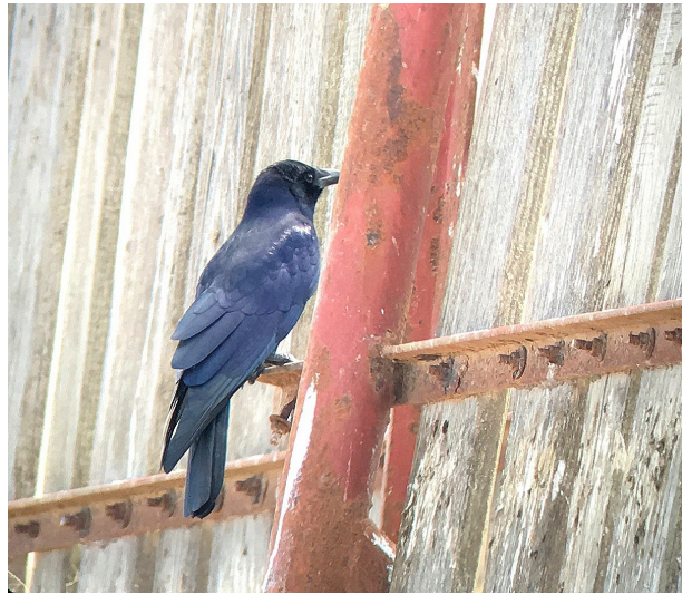
Tamaulipas Crow.

The Brownsville landfill was next, where Tamaulipas Crows had been reported after being gone for many years. I joked that it would be great to drive up and find someone looking at one. Well, that's what happened. A woman was waving to us, as she had it in her scope. Being a typical landfill, there are thousands of birds there; grackles, vultures, gulls, waders, etc. Luckily, the crow likes to perch near the road. We also picked up Bronzed Cowbird and Chihuahuan Raven. Tropical Kingbird and Bewick's Wren were added just outside the gate. After 45 minutes of smelling a landfill, we headed for lunch!