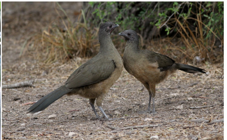
Plain Chachalaca.

We started our morning at Sabal Palms Sanctuary. Our best bird was a Tropical Parula, in with a small warbler flock. A Gray Hawk made a quick flyover. We also added White-tipped Dove, Wilson's Warbler and Buff-bellied Hummingbird.