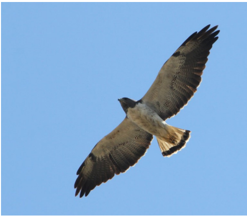
White-tailed Hawk.

The Port Aransas jetties gave us the rest of our gulls, terns and a few more shorebirds. Our next two stops were closed due to hurricane damage. On the way to Mustang Island State Park, also closed, we got good looks at a pair of White-tailed Hawks. Going back inland, we headed for Kingsville for the night, finishing with 110 species.