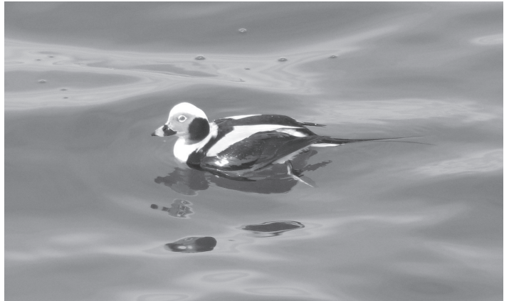
Drake Long-tailed Duck

Harbor Seals on islands three and four entertained as they porpoised, bobbed, and sunbathed, while a pair of Yellow-rumped Warblers proved that there really are few habitats that the little birds will not occupy.