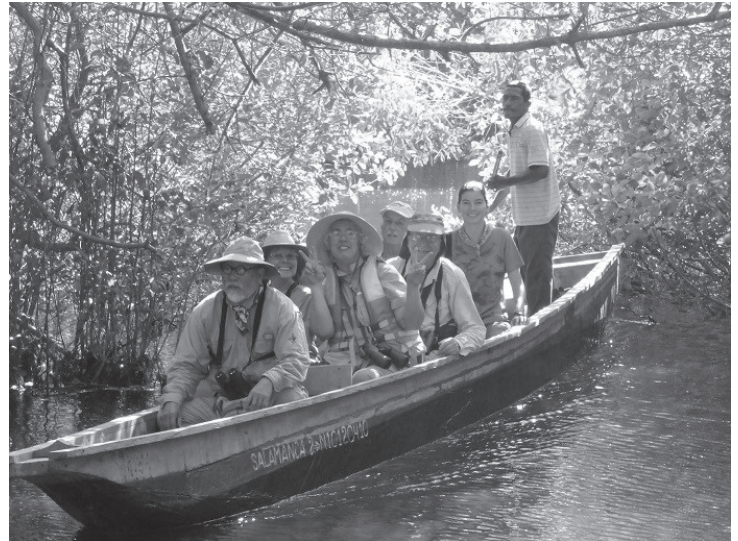
Birding... CBC style!

The Carolina Bird Club recently donated to the conservation organization Saving Species, whose main objective is to stop extinctions in the most biodiverse and threatened places in the world. Saving Species has funded conservation projects in Brazil, Madagascar, and Colombia. This collective of senior conservation scientists invests all its donations into the protection or restoration of important habitat for critical species by partnering with local organizations. The funds donated by the CBC will contribute to bird conservation in Colombia in places that generate the largest conservation benefit by protecting high concentrations of endemic and threatened birds. This donation was inspired by the success of a recent CBC bonus field trip to Colombia led by the authors. Colombia is home to more bird species than any other country in the world, but unfortunately many are at risk of extinction. The trip leaders and CBC executive committee agreed that a portion of any unspent trip funds should be set aside for bird habitat conservation in Colombia, and we felt that Saving Species would be an ideal recipient for such a donation due to their ongoing conservation efforts in Colombia. For more information on Savings Species, see http://savingspecies.org .