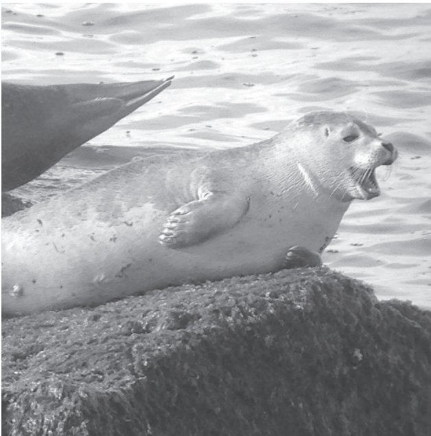
Harbor Seal on CBBT Island #4

Highlights on the complex’s four manmade islands included “singing” Black Scoters, various plumages of Surf Scoter, unusual numbers of White-winged Scoters, stunning looks at Long-tailed Ducks, nearly a dozen Red-necked Grebes, and a Wood Duck that took up with a raft of sea ducks. More than thirty