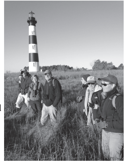
WOW participants enjoy "railing" at the Bodie Island lighthouse pond.

Look for 2014 dates to be released soon!