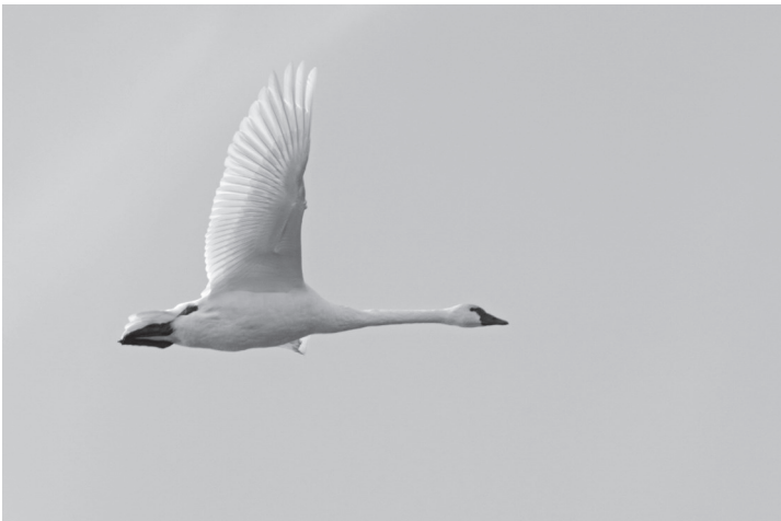
Tundra Swan at Pea Island - Phil Fowler

Sunday dawned overcast, but without the fresh north-northeast breeze that made conditions on Saturday somewhat challenging. With reports of a Snowy Owl just 45 minutes away by car, the group overwhelmingly voted to change the scheduled itinerary and head south to Cape Hatteras. On the broad, sandy beach just south of the cape's point, a miniature, white R2-D2 was picked up in spotting scopes scanning the shore. Yes, that rotund character was the almost-famous Cape Hatteras owl. Not wanting to add undue stress to the majestic northern visitor's morning, the group remained well back from the bird, but constant traffic on the nearby public beach eventually convinced the owl to move to more private surroundings. Nearby, a trio of Snow Buntings put on an aerial exhibition for a few lucky birders.