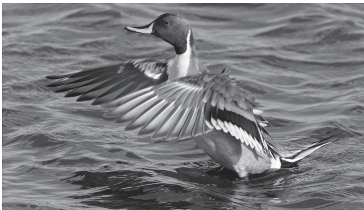
Northern Pintail at Bodie Island - Phil Fowler

The trip ended in the early afternoon at Alligator River NWR. Here a trio of upstart River Otters threatened to push aside the rafts of ducks and swans for top billing. The trip ended with just over 100 species observed, which is not too bad considering that very few woodland birds made their way to the list. We may not have seen a cardinal, but we would gladly trade that sighting for those Snow Buntings!