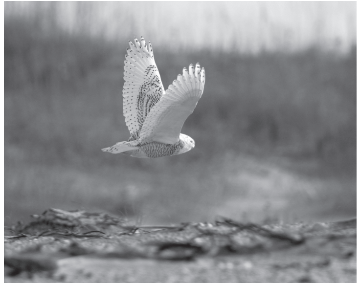
Snowy Owl at Cape Hatteras - Phil Fowler

a Humpback Whale feeding within sight of the pier was the non-avian highlight of the day. The whale's frothy blow could be seen on and off for more than thirty minutes as the "long winged New Englander" chased schools of baitfish with groups of Inshore Bottlenose Dolphins in attendance. At one point the whale's lunge feeding brought the massive jaws out of the water, and the low, bumpy back that gives this whale its name was often visible.