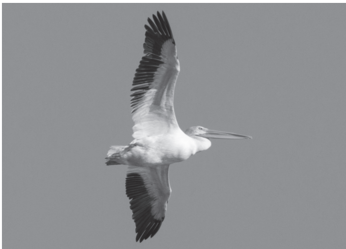
American White Pelican at Pea Island

We hope to see you on a CBC “bonus trip” in the future; keep an eye out for new trip announcements in upcoming editions of the CBC Newsletter and on the club’s website at www.carolinabirdclub.org