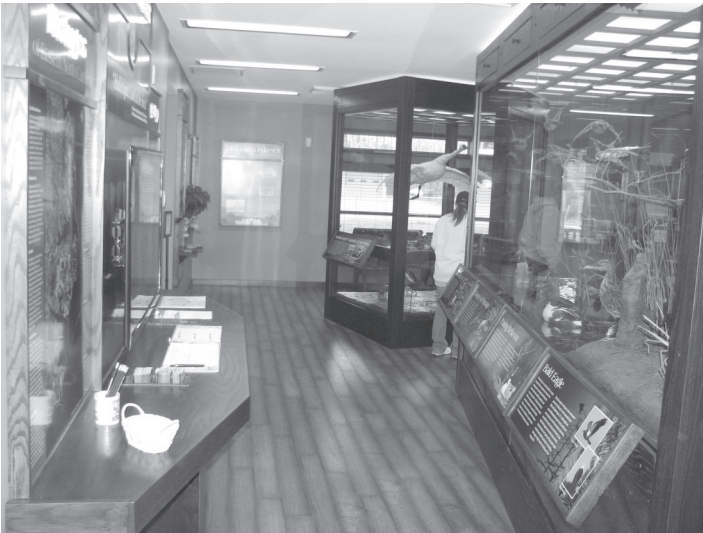
Inside the new visitor center

Visitors used to spartan facilities now enjoy a new visitor center with wildlife displays, informational exhibits, and staffers that can provide current refuge information. There are also indoor bathrooms (no more relying only on portable potties!)