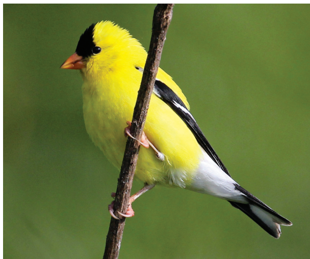
Male American Goldfinch.