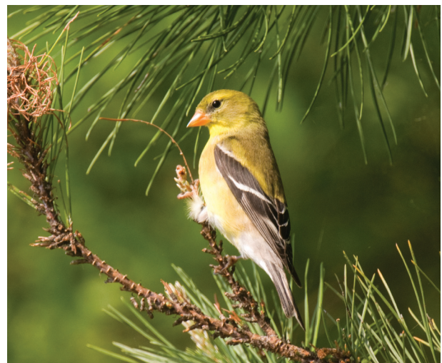
American Goldfinch.