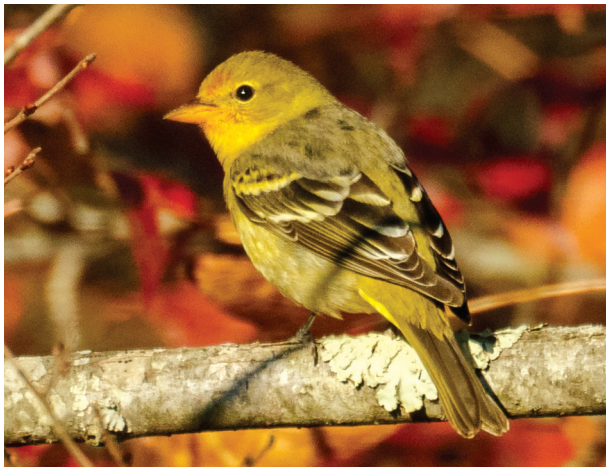
Western Tanager in Charlotte yard.