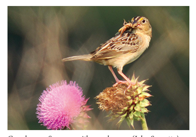
Grasshopper Sparrow with grasshopper.

Rhett Chamberlain conducted a breeding season study of nesting Grasshopper Sparrows in southeastern Charlotte during the spring and summer of 1945. He