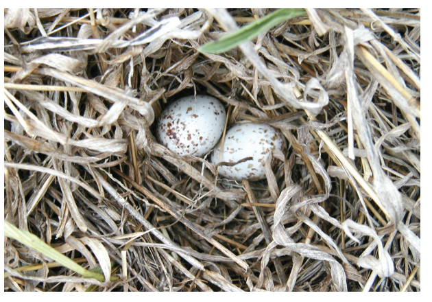
Grasshopper Sparrow nest. (MCPRD staff)