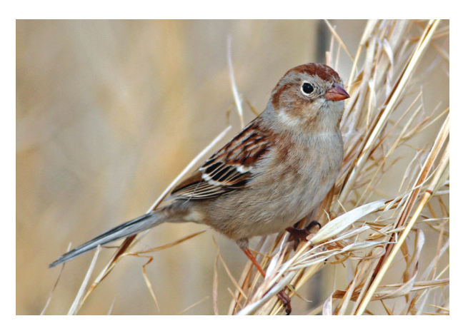
Field Sparrow. (Will Stuart)

The Field Sparrow is a resident bird that breeds throughout the Carolina Piedmont. Counts of more than 300 or 400 birds were common on Christmas Bird Counts in the region in the 1970s. Today, volunteers struggle to tally more than 100 on Christmas counts. Our highest