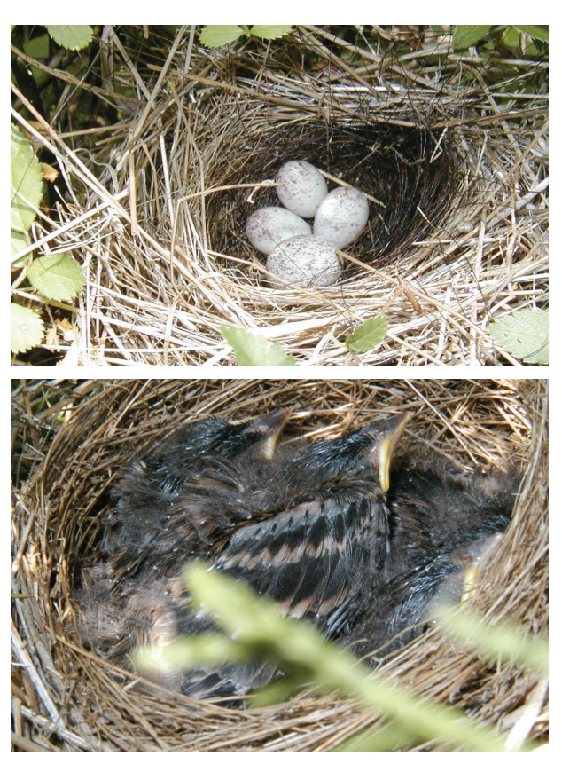
Field Sparrow eggs and week-old nestlings.

In 2007, the National Audubon Society warned that the Field Sparrow is "a common species" that is in serious decline, with more than 70% of its population lost nationally in the past 40 years. In 2014, the North American Bird Conservation Initiative warned that the population of the Field Sparrow is rapidly declining throughout its range.