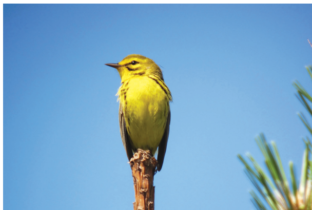
Prairie Warbler.