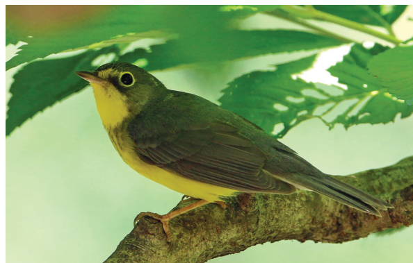
Canada Warbler. (Jim Guyton)

The Canada Warbler is listed on the Yellow Watch List of birds of the continental United States. It is a species with both "troubling" population declines and "high threats." It is in need of conservation action.