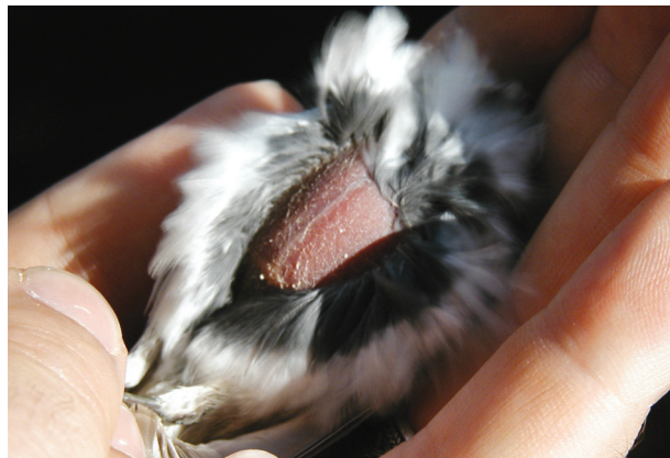
The brood patch was checked on this female warbler while it was being banded. This patch helps keep the eggs warm while she sits on the nest.

The Black-and-white Warbler is a scattered breeding bird in forests throughout the Carolina Piedmont. It is more common in western counties and in areas with more forest cover. It is rare to absent in most heavily developed regions. We have records of this warbler present in the region every month of the year, though it is rare from November through February. Spring migrants generally arrive in the region in March and move through by the end of October. Our peak one-day count is 26 birds.