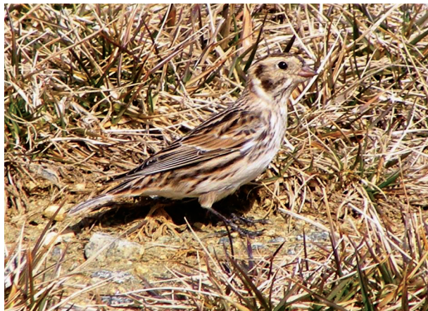
Lapland Longspur in a backyard in Huntersville.