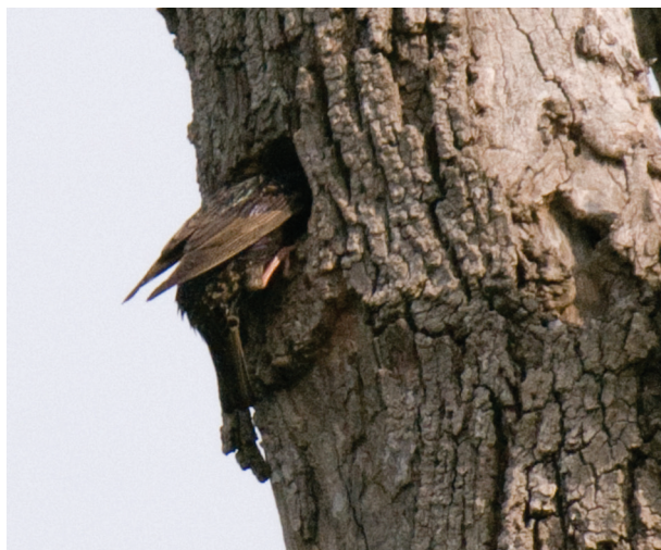
European Starling inspecting a nest hole. (Jeff Lemons)

Starlings are a cavity-nesting species known for their aggressive nature and prolific breeding. They often attack native cavity-nesting birds, driving them from their nest sites. They have been known to injure or kill other birds, and they readily destroy other birds' eggs. In many areas, populations of several species, like the Eastern Bluebird, Red-headed Woodpecker, Northern Flicker, and Purple