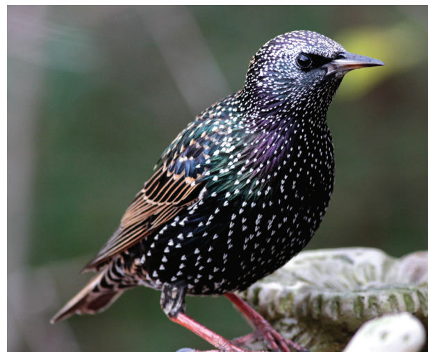
European Starling in December. (Will Stuart)