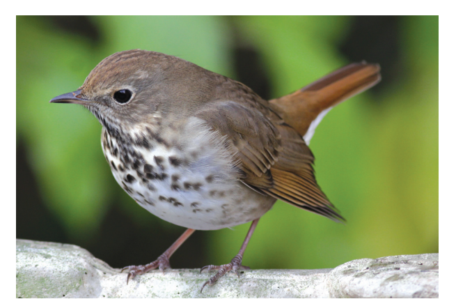
Hermit Thrush. (Will Stuart)

But here was my discovery of the day. I had no dream they were within a good five hundred miles. I saw him across the creek down on a low limb over the water. From there he flew down, hopped a few feet, stopped and picked up a worm. As he stood