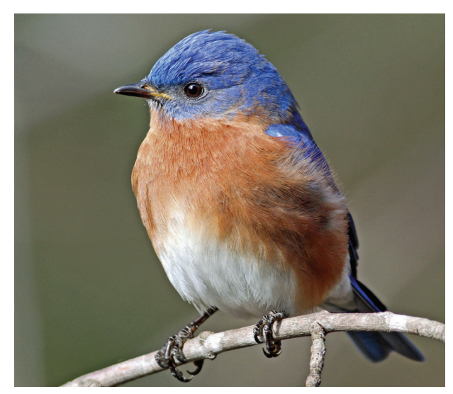
Eastern Bluebird. (Will Stuart)

This scene still plays out today in yards, neighborhoods, and on farms, throughout the Carolina Piedmont. Eastern Bluebirds will only nest in a cavity, and there is always a limited supply of natural nest holes available. Once a suitable hole is found, a bluebird will often have to fight to defend it and keep it. The centuries-old practice of providing usable artificial nest cavities helps to increase