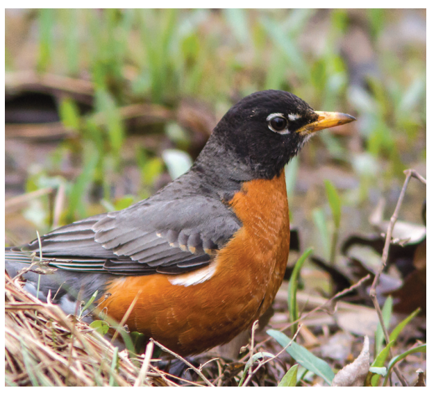
American Robin.