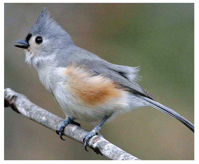
Tufted Titmouse.

The Tufted Titmouse may be called an abundant resident with us, and, at nesting time, one can stroll