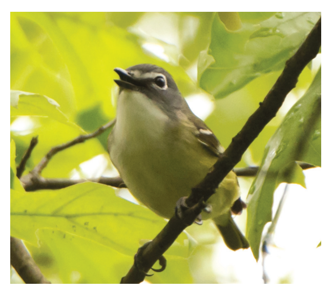
Blue-headed Vireo.

Despite the rapid loss of appropriate nesting habitat in the latter part of the twentieth century, the Blue-headed Vireo remained designated a possible rare summer resident in Mecklenburg County through the early 1980s. No recent nest records are known and Breeding Bird Atlas volunteers found no evidence of breeding during the recent BBA survey. Therefore, in Mecklenburg County, the Blue-headed Vireo has been placed on the "Lost" list of breeding birds.