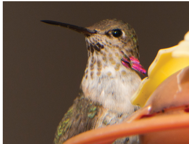
Immature male Calliope Hummingbird in Charlotte.