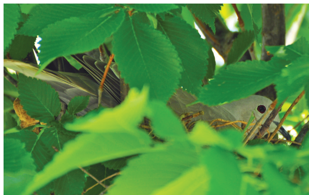
Eurasian Collared-Dove on nest in May.