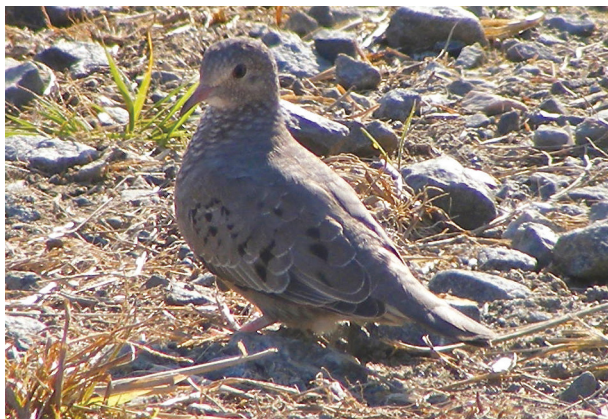
Common Ground-Dove at McDowell Nature Preserve.

By the early twentieth century, “breeding ground-doves were unknown in North Carolina,” but several specimens of wandering birds were collected from the coast and the Piedmont of the state. One bird collected in Rutherford County was received by the State Museum in Raleigh on November 18, 1924, and one bird from Guilford County was received on November 18, 1933. A second so-called “invasion” along the coast of North Carolina began in the 1930s, and sporadic breeding was documented or suspected between Brunswick and Carteret County over the next 50 years.