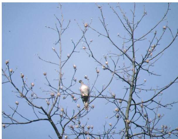
Band-tailed Pigeon in Charlotte on March 13, 1994.