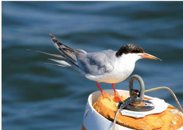
Forster's Tern on Lake Norman buoy.