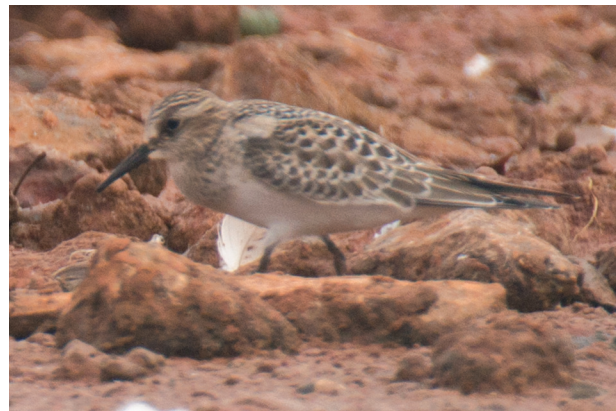
Baird's Sandpiper on shore of Lake Norman.