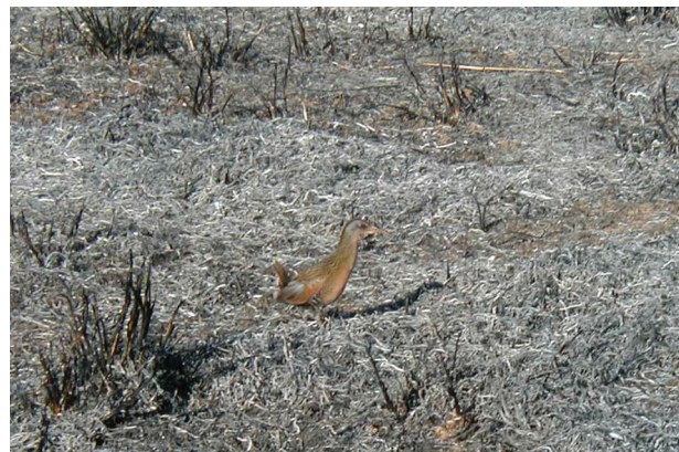
Virginia Rail escaping controlled burn in a field at Cowan’s Ford Wildlife Refuge.