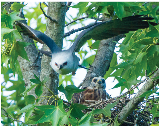
Adult Mississippi Kite with young in suburban Charlotte.