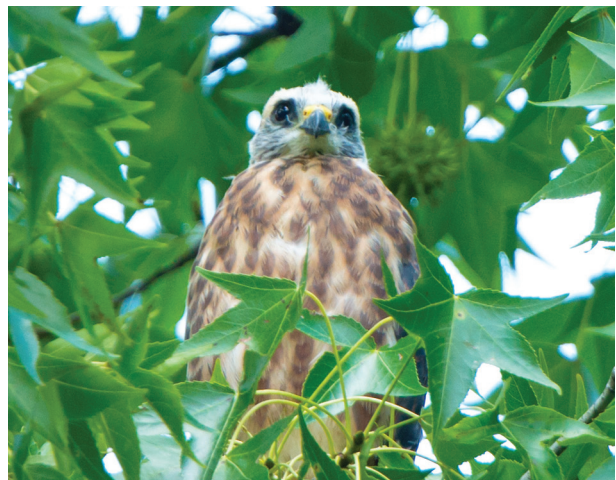
Fledgling Mississippi Kite. (Phil Fowler)