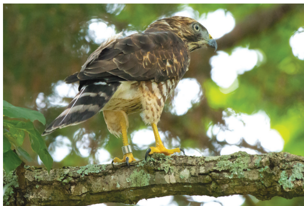
Broad-winged Hawk banded and released by the Carolina Raptor Center.