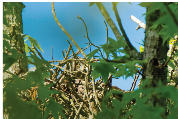
Broad-winged Hawk on a nest—always a challenge to see.