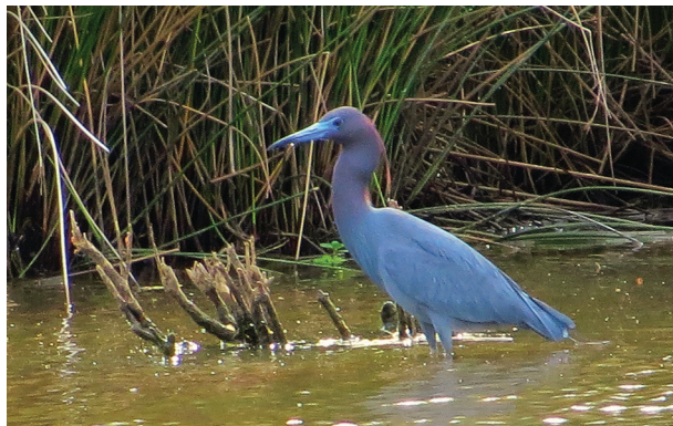
Little Blue Heron in Pineville.