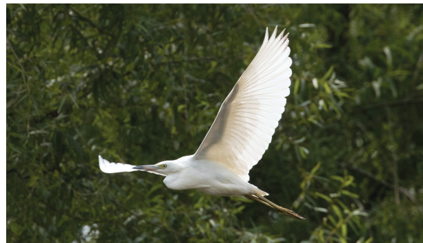
Immature Little Blue Heron over the Catawba River. (Jeff Lemons)