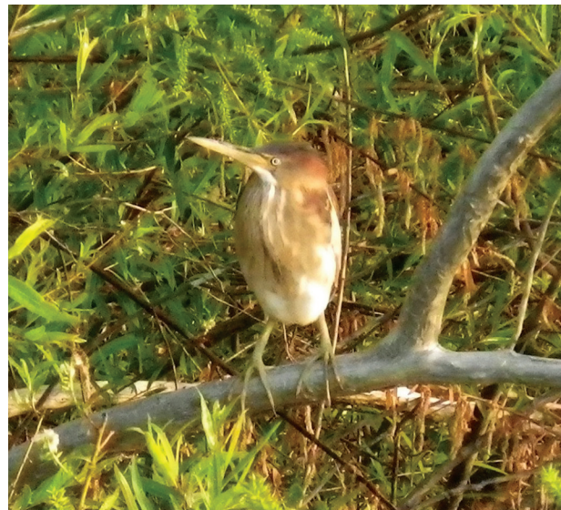
Least Bittern at Cowan's Ford Wildlife Refuge.