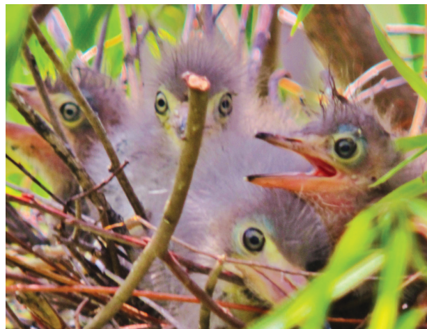
Nestlings in Pineville.