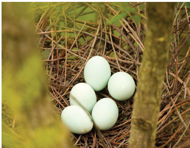
Green Heron nest in Charlotte.