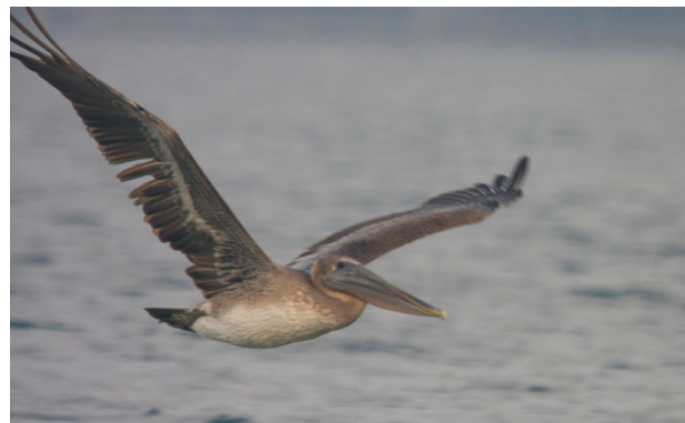
Brown Pelican on Lake Norman.

Reports of Brown Pelicans on inland lakes in the Carolinas have been slowly increasing over the past two decades. A Brown Pelican was reported on Lake Wylie in