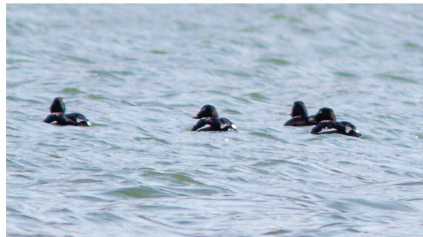
White-winged Scoters on Mountain Island Lake.