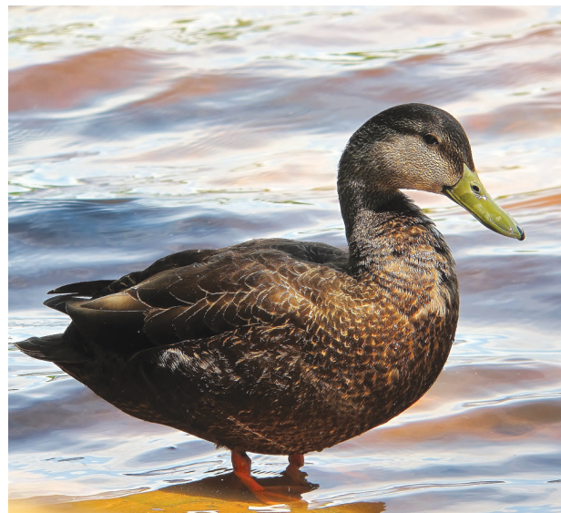
American Black Duck. (John Scavetto)

One flock of more than 2,000 Black Ducks (seen in 2001) has been reported at Pee Dee NWR since the turn of the twenty-first century, but most flocks seen in the region today average fewer than 75 birds. Early