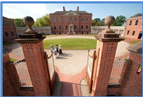
Tryon Palace architecture is memorably appreciated on a tour.

WHERE WE WILL BIRD: We plan to provide opportunities to see by boat either the Rachael Carson Reserve or the bird-rich Shackleford Banks. A trip to Cape Lookout will be the third option in the all-day category requiring water craft. ½ day water excursions in the inland islands behind Bear Island and a trip to Bear Island are on the itinerary. These 5 tours require a cost per attendee for the boat. Many land trips will go into habitats of the Croatan Forest, home of the Red-cockaded Woodpecker, to North River Preserve, over 8000 acres of farmland being returned to wetland habitats, and eBird Hotspots in New Bern and nearby salt-water marsh sites. A walk on Bogue Inlet with a monitor from Emerald Isle of the