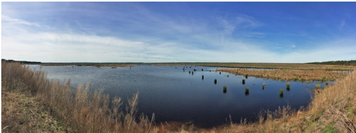
North Carolina Coastal Federation's North River Wetlands Preserve

REGISTRATION: Details will be in the August Newsletter. Early registration will be important to secure your room.