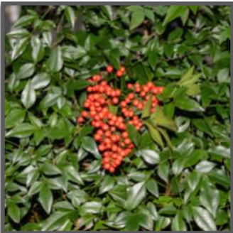
Nandina

Do you recognize this plant? It is known as Nandina, Sacred Bamboo, or Heavenly Bamboo. It is located in all of the lower 48 states and it commonly planted in yards, parks, and around businesses. Nandina is an invasive, non-native plant, and its berries, as well as the leaves, are laden with cyanide and other alkaloids that produce highly toxic hydrogen cyanide which is extremely poisonous to all animals. Cyanide poisoning and death can occur rapidly, usually within minutes to an hour.