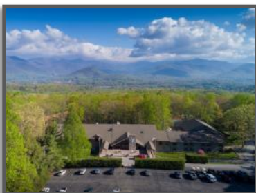
YMCA Blue Ridge Assembly