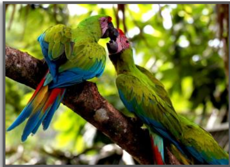
Great Green Macaws