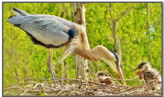
Great Blue Heron Family

Growing up in West Palm Beach, Florida in the 60’s, we spent many weekend afternoons at the beach. Traveling to and from the still unspoiled barrier islands, I learned a few more birds – Sea Hawk, Sparrow Hawk, Sea Gulls and oh yes, the Mosquito Hawk - insert smiley face emoji here. But I spent as much time as possible with a mask and snorkel, underwater observing. This made me a shell collector and I finally asked for and got what was a field guide. My 6 th grade teacher saw the observer in me and did something which now stuns me. He found a microscope, brought in his college biology text, gave me jar of “pond scum” and assigned me to draw what I saw on the slides he taught me to prepare. I’d give anything to have that little notebook today.