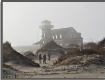
Oregon Inlet - Photo by Richard Hayes

A witches' coven of Carolina Bird Club members pounded sand, cruised gravel roads, scrambled over rocks, and bushwhacked through Salt-meadow Cordgrass on a very good (some may successfully argue "great") "bonus trip" this past weekend to the Outer Banks and associated inland Refuge areas of Eastern NC. Bonus trips are one of the occasional non-seasonal meetings sponsored by the club.