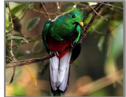
Resplendent Quetzal

species of birds. Some species highlights include 2 Sunbittern, dozens of Great Green Macaws, and 5 Resplendent Quetzals. We saw a total of 31 endemics including Spangle-cheeked Tanagers, Golden-browed Chlorophonias, and Volcano Juncos. While birds were our primary focus, we of course saw many mammals, reptiles, and amphibians. Highlights include the Talamancan Palm Pit Viper, which is an endemic snake only found in the Cloud Forest of Costa Rica. We also saw three species of poison frogs: Black and Green Poison Frog, Lovely Poison Frog, and Strawberry Poison Frog. Of course, a proper trip to Costa Rica is not complete without seeing the Hoffman's Two-toed Sloths, Three-toed Sloths, Capuchin Monkeys, Mantled Howler Monkeys, and Spider Monkeys. An amazing variety of wild-