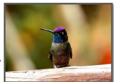
Talamanca Hummingbird - Photo Courtesy of Epic Nature Tours

The next morning we understood the true meaning of the term 'rain forest' as we spent the morning listening to the sounds of the rain dance on the tin roof of the covered porch of our house. We didn't mind the rain since it gave us the pleasure of watching Long-billed Hermits and other hummingbirds dodge raindrops as they buzzed from flower to flower right in front of us. Before long, the rain lightened and we were able to meet up with our incredible local guide Abel to enjoy a bird walk along the edge of town before exploring jungle trails of the Gandoca-Manzanillo Wildlife Refuge. Highlights included Crested Caracaras, Pale-vented Pigeons, Mealy Parrots, Masked Tityras, and a Ruddy-tailed Flycatcher.