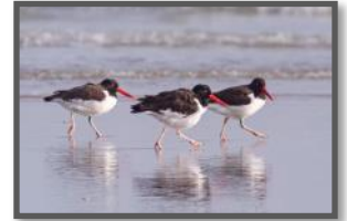
American Oystercatchers

Sunday dawned bright, clear, and surprisingly still. All heard Virginia Rail calling, and several saw the slinky little birds at Bodie Island before we headed south and hiked out to the old inlet at Split Pea for maritime sparrows. Here we enjoyed the "Marsh Grand Slam" of Nelson's, Saltmarsh, and Seaside Sparrows along with Marsh and Sedge Wrens.