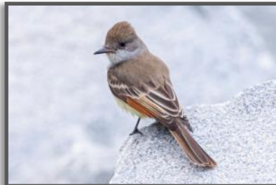
Ash-throated Flycatcher