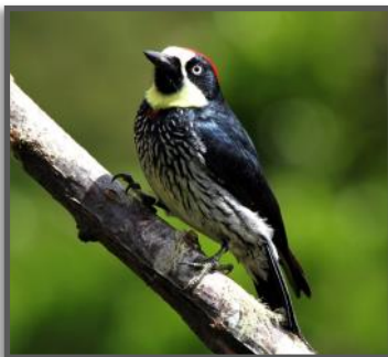
Acorn Woodpecker

while watching Emerald Toucanets, Large-footed Finches, Sooty Thrush, Flame-colored Tanagers, White-throated Mountain-gems, Talamanca Hummingbirds, Scintillant Hummingbirds, Lesser Violetears, Acorn Woodpeckers, Yellow-thighed Finches, and more. While some thought the day could not get any better, our next stop was the Batsu Gardens - a beautiful garden built around an apple orchard with a dozen hummingbird feeders and a fruit feeder for tanagers. We saw dozens of hummingbirds, and added Steely-vented Hummingbird to our list, along with White-naped Brush-finch, Chestnut-capped Brush-finch, Rose-breasted Grosbeak, Tufted Flycatcher, Silver-throated Tanagers, Volcano Hummingbird, Stripe-tailed Hummingbird, and many others.