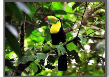
Keel-billed Toucan

After lunch we drove up an incredibly steep hill to visit the ARA Project. ARA is a nonprofit organization doing incredible work reintroducing the Great Green Macaw to the Caribbean lowlands. During our visit at ARA, we were able to learn about the conservation work surrounding these amazing birds, and watch several dozen wild macaws fly above our heads. While the macaws took front and center on the stage, we also had fantastic views of Keel-billed and Yellow-throated Toucans.