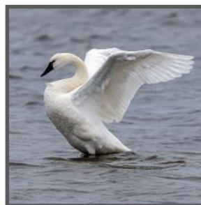
Tundra Swan

We ended the trip with 122 species, bear, bobcat, otter, Inshore Bottle-nosed Dolphin, deer, and a great group dinner at Blue Water Grille.