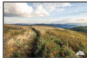
Max Patch - Photo courtesy of AshevilleTrails.com

Black Mountain is close to the entrance to the Blue Ridge Parkway, so many of the trips will be on or near the parkway both north and south of Asheville, as well as in the adjacent Pisgah National Forest, all great places for migratory songbirds. Expect typical mountain breeding species such as Black-throated Green, Black-throated Blue, Chestnut-sided, Canada, Worm-eating, Blackburnian, Swainson's, Cerulean, and many other warblers as well as many tanagers, grosbeaks, thrushes, vireos, and possibly the always unpredictable Red Crossbills. Other sites visited will be along the Blue Ridge Escarpment and at local parks, good places for many other species, and at Max Patch, a historically reliable spot for Golden-winged Warblers and many other warblers. Meeting dates are April 30 th to May 3 rd .