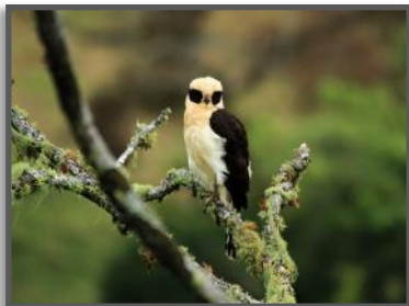
Laughing Falcon

We began the next morning with a cup of gourmet coffee and a walk around the gardens where we saw a Red-headed Barbet, Black Phoebes, Common Chlorospingus, Barred Antshrike, Slate-throated Redstarts, and more Baltimore Orioles in one day than I have seen in my whole life in the US. We came back for a delicious breakfast and then visited the Guayabo National Monument, the oldest pre-columbian ruins in Costa Rica. These ancient ruins are hidden deep in the jungle, and the clearings made by archeologists, create a perfect place to go birdwatching as well as to learn about the history of the area. We watched a Golden-olive Woodpecker working on her nest, chased a pair of Black-throated Wrens through dense vegetation for at least ten minutes, and at the end, came into one of the best mixed flocks of birds I have ever experienced! In the span of a few minutes we saw, Streak-headed Woodcreepers, Buff-throated Foliage-gleaners, Mistletoe Tyrannulet, Olive-striped Flycatchers, Slaty-capped Flycatchers, Scale-crested Pygmy-tyrant, Rufous-winged Tanager, Bay-headed Tanager, Red-throated Ant-tanagers, and more! Upon our return to the lodge we had a well-earned lunch followed by a