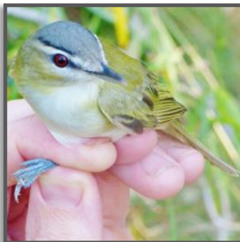
Red-eyed Vireo

I went on to study botany and microbiology. Believe it or not there is much beauty in what is seen under a microscope and in a petri dish. My interest in the observation of details in nature was leading me to my career of diagnostic microbiology and infection control. But birds were out there for me. One Saturday on a botany class field trip near Gainesville, FL, my eyes were opened to what would become an enduring source of joy in my life. Our professor, wearing his pith helmet and khaki field gear (mind you this was pre L.L. Bean and Gortex), pointed to the sky and quietly said “Swallow Tailed Kite.” I saw a black and white “X” for a moment. I asked him to repeat what he said and he grinned as he told me. Yes, I still remember that moment. And I knew then that I needed to know more. I nearly lost my shoes in a swamp that day and ripped my jeans climbing through a barbed wire fence. It didn’t stop me from going to the campus bookstore and finding my first field guide. The Audubon paperback with a vinyl cover. That was my first mistake. I was not a birder yet. And it was ok because birding was not in my vocabulary.