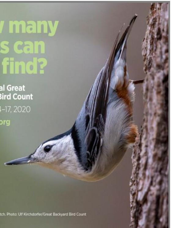
White-breasted Nuthatch.