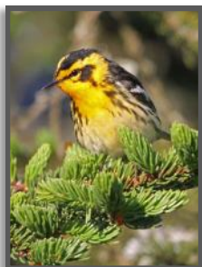
Blackburnian Warbler

We will be returning to the mountains again for the 2020 Spring CBC Meeting in Black Mountain, NC about 10 miles east of Asheville. So it will be time to brush up once again on those mountain warblers and other neotropical migrants that typically breed or travel through the mountains of WNC.