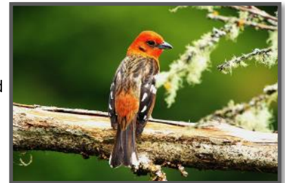
Flame-colored Tanager - Photo Courtesy of Epic Nature Tours

For lunch we went to Miriam's Quetzals - the most famous restaurant in the Valley with a renowned birdfeeder off the back deck. We feasted on possibly the best trout on Earth