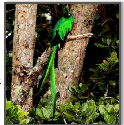
Resplendent Quetzal

Our last day began with a wild goose chase, or in this case, a wild Rufous-collared Sparrow chase through the hotel lobby. Once the bird was successfully relocated, we all piled into the SUV and began our drive to San Jose to catch our flights home.