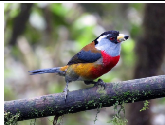
Toucan Barbet - Mindó, Ecuador, March 2018.

Ecuador is the size of the state of Georgia, yet 1,540 species of birds have been recorded in the country. Of these, 133 are hummingbirds. On this Venture we'll travel across the Andes, seeing a dazzling display of tanagers, fly-catchers and hummingbirds; over high, windswept pass to relict patches of the Polylepis Forest for the endemic Black-breasted Puffleg (very rare); through Chocó Cloud Forest, where we hope to find such regional humming-bird endemics as Empress Brilliant, Velvet-purple Coronet; and lower elevation forest on the east slope where we should see Golden-tailed Sapphire, Wire-crested Thorntail and the dramatic Black-throated Brilliant./Continued P.4