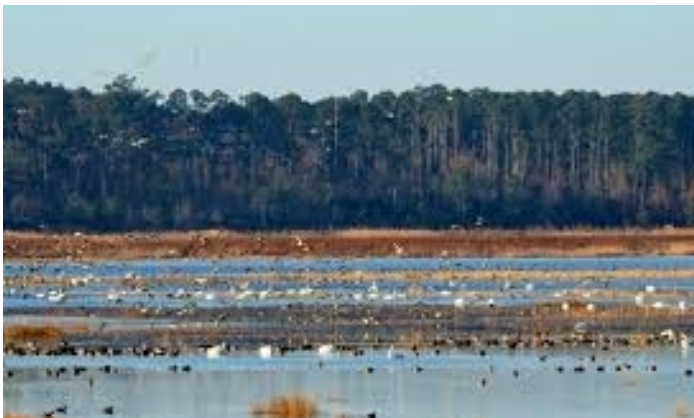
Lake Mattamuskeet. www.take-a-trip.info .