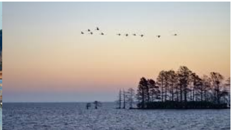
Lake Mattamuskeet.