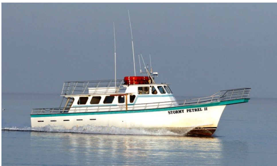
Stormy Petrel II. Offered by Brian Patteson for two pelagic trips.

The northeast coastline during North Carolina’s winter is probably the best birding location. In recent winters observations have included Common Eider and Harlequin Duck. We should see the three North American Scoter species and possibly Long-tailed Duck on any shoreline watch. We will search for a Ross’s Goose among hundreds of Snow Geese. Eurasian Wigeons are winter regulars at Pea Island, and scattered Horned Grebes can be seen from the beach. With any luck, we could see Iceland or Glaucous Gull at Cape Point and possibly a Thayer’s or California Gull. Interesting passerine observations have included species such as Ash-throated Flycatcher,