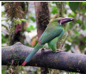
Crimson-rumped Toucanet - Mindó, Ecuador, March 2018.