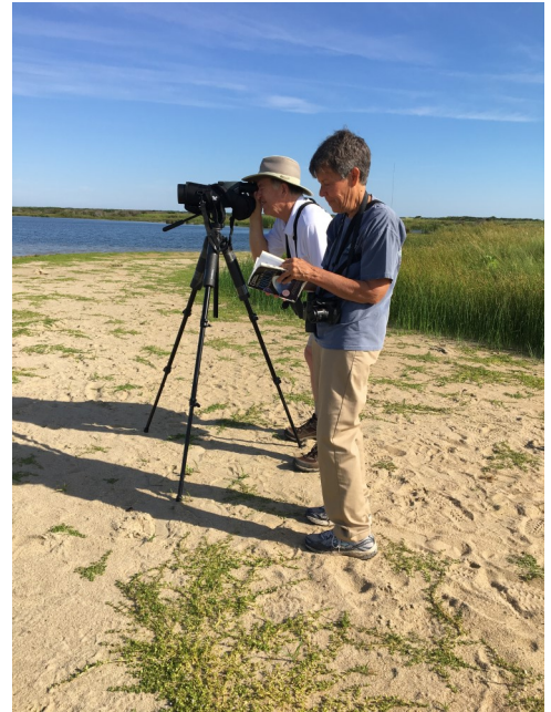
Birders participating in "Birding the Barrier Islands." Research grant awarded by the Carolina Bird Club's Research & Education Grant to the Hatteras Island Ocean Center, Inc.

Our central introductory question to begin this program focuses on addressing how so many different species of birds survive in the same location without outcompeting one another. The bird foot molds are used as visual aids for our participants. Most of the birding trips take place at the Hatteras Village Park in Hatteras, NC. However, we have also scheduled programs at Ramp 44 parking lot on Cape Hatteras National Seashore property. Highlights from these trips have included Roseate Spoonbills, Piping Plovers, Least Terns, Black Skimmers, Little Blue Herons, and Spotted Sandpipers. The spotting scopes have greatly improved and enhanced the experience of program participants, providing close-up views that allow us to hone in on characteristics that assist in correct identification.