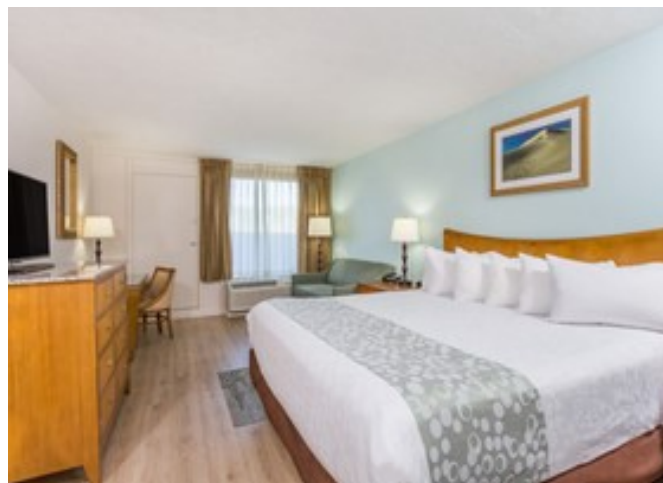
Ramada Plaza, Nags Head, NC. King Room with Oceanview.

Both Friday and Saturday evenings will host cash bar and social hours: Friday at 6:00pm, with programs beginning at 7:00pm and Saturday at 5:30pm with the buffet dinner starting at 6:30 pm and our program following at 7:15pm.