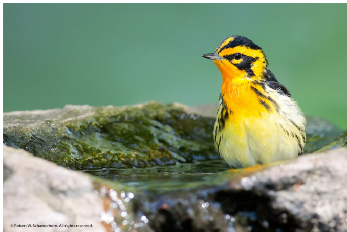
Blackburnian Warbler in bird bath.

One-hundred and eighty species were recorded at the last OBX Weekend in 2017, with absolutely spectacular calm, comfortable winter weather. A Golden Eagle was seen at Alligator River NWR and an Iceland Gull was seen at Cape Hatteras, as well as the infamous Anna’s Hummingbird. Razorbills and a Dovekie from Jeanette’s Pier made those members with lighter coats still feel warm inside.