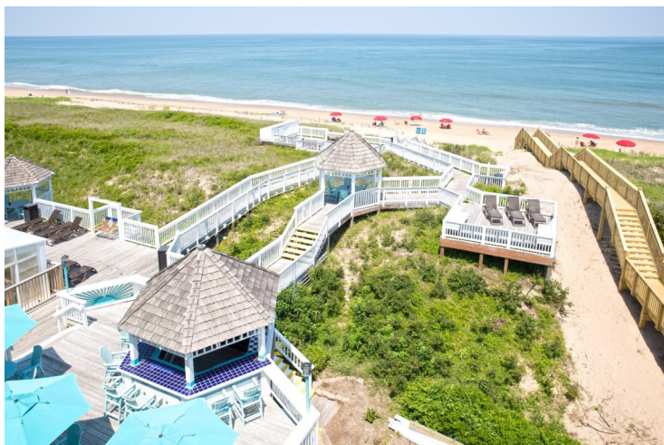
Ramada Plaza, Nags Head, NC.