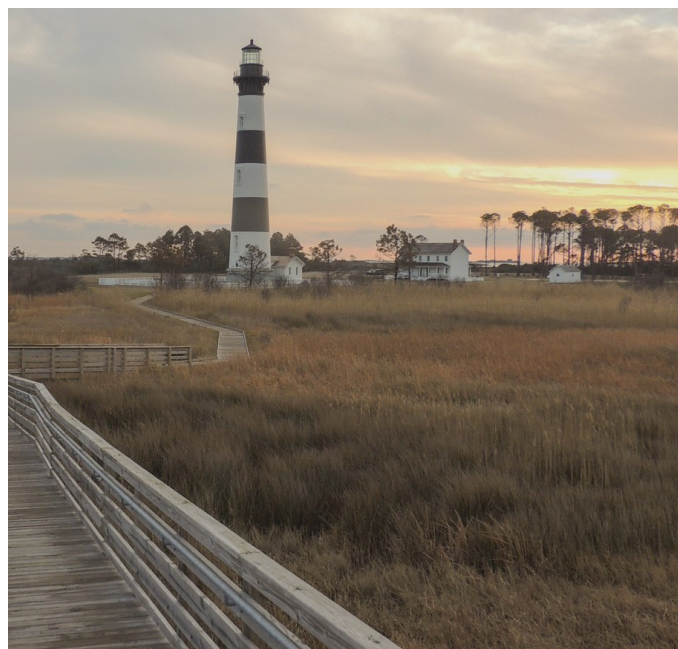
Outer Banks Lighthouse.

Complete Seasonal Meeting details, registration information and trip descriptions will be in the December 2018 issue of the CBC Newsletter and on our website: www.carolinabirdclub.org .