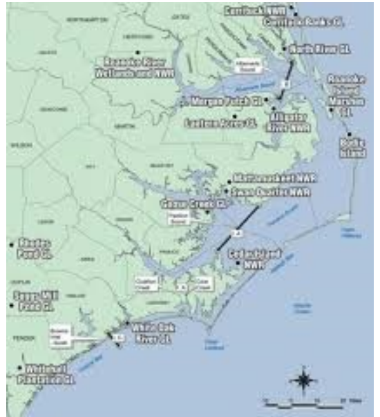
Map of Lake Mattamuskeet

Environmental hazards are few, and annoying insects are not usually problematic, but bring weather appropriate clothing and note that food service may be somewhat limited in Hyde County. Registered participants will receive a detailed FAQ with suggestions on lodging and food.