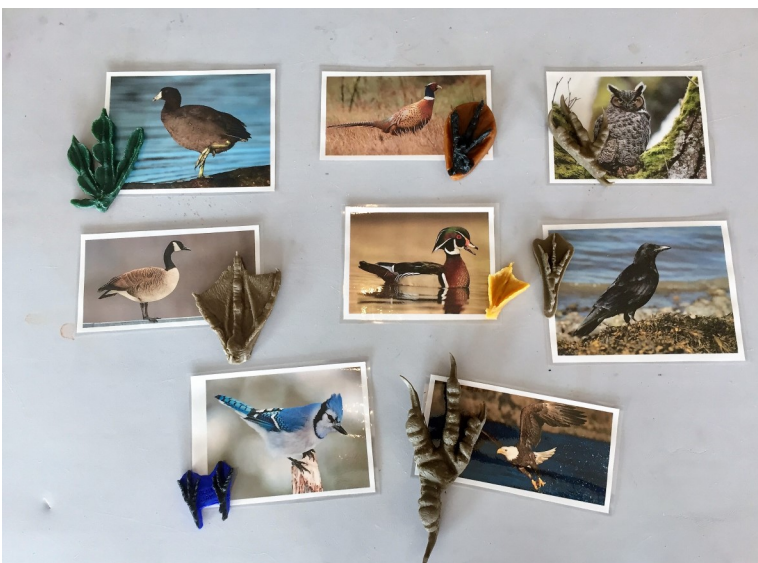
Birds tracked by Hatteras Island Ocean Center, Inc during the "Birding the Barrier Islands" Research Project.

Since we opened for the 2018 season in May, we have booked seventeen participants for this new birding program and have even been positively reviewed on Trip Advisor. "We went on a morning bird walk, part on the marsh and part on the beach, and identified a large variety of birds. The two staff who led it were very knowledgeable and enthusiastic. We highly recommend it!" We are excited for this opportunity to share our knowledge and hope to continue this program throughout the winter and into next year.