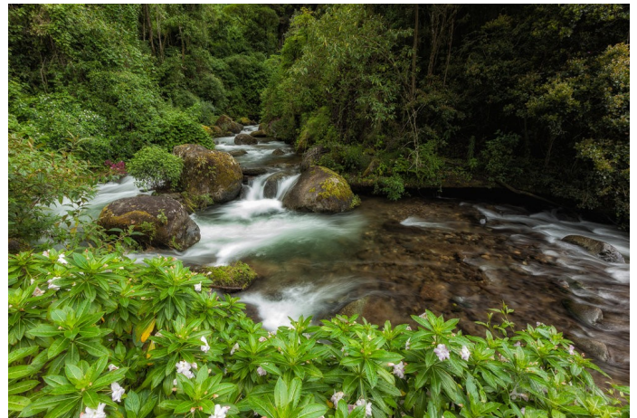
Savegre Foothills, Costa Rica

The second trip will be "Southern Costa Rica" and will run from February 25 to March 6. This trip will include the Highlands including Savegre and Pacific foothills as well as Pacific Southwest Costa Rica.