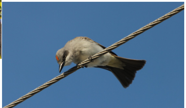
Gray Kingbird.

Part of the fun and challenge of this trip was figuring out what birds are presently ABA-countable. Miami and southern Florida have perhaps the largest population of free-flying parrots and other exotic species.