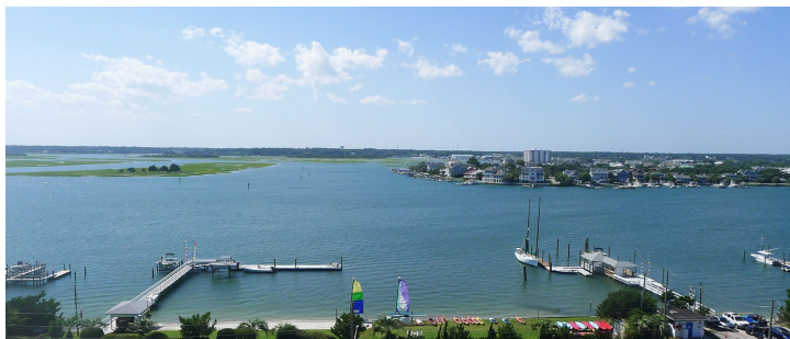
Boat Slip at Blockade Runner Beach Resort