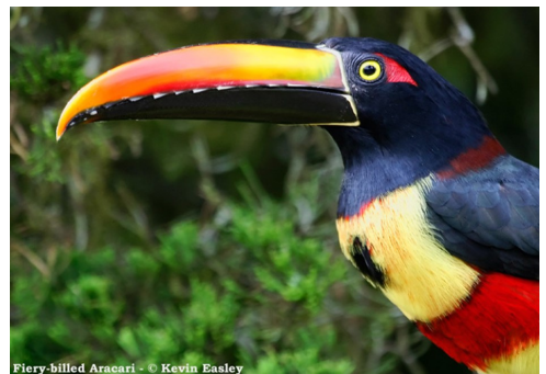
Firey-billed Aracari.

Both trips will be packed with excellent birding. For a detailed itinerary and description of each trip and information on registration, please go the CBC website.