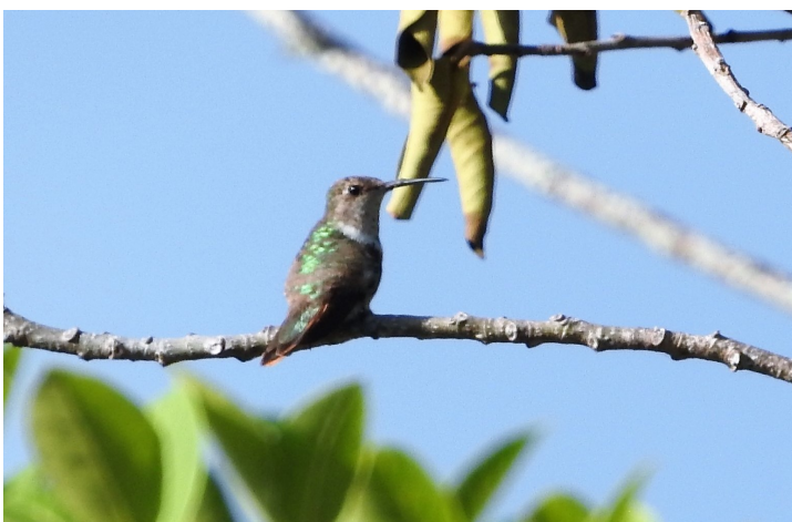
Bahama Woodstar.

Red-whiskered Bulbul became my 600th ABA area bird. Then we drove for about three hours up the Atlantic coast on a hot tip that a Bahama Woodstar, only seen five times previously in the ABA area, had been seen the day before in the Sebastian inlet area.