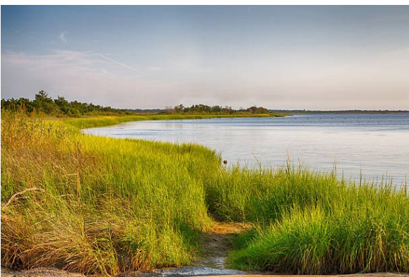
Cape Fear River

Wrightsville Beach is just across the Intracoastal Waterway (ICW) from Wilmington. The two towns are situated between the Cape Fear River and the Ocean. Wrightsville Beach and Wilmington boast of many fine restaurants along the coast and in the downtown area respectively. The Wilmington downtown River Walk along the Cape Fear River is a great place to hang out for site seeing, shopping and for great food and beverages. So even though our hotel is on Wrightsville Beach, Wilmington is just across a couple of bridges to our west.