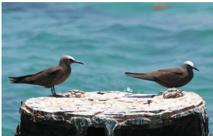
Brown Noddies on the coal docks at Fort Jefferson.

A bit more effort, as usual, was required for the Mangrove Cuckoo. Both sang extensively. White-crowned Pigeons offered tantalizing looks on Key Largo and every day in the Keys, but were not well-seen until Key West.