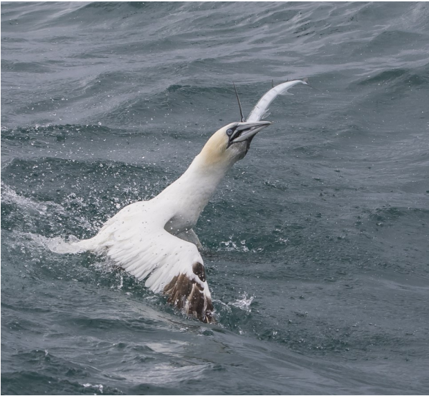
Northern Gannet.

Ocean watching at Wrightsville Beach will be available from Johnnie Mercer's pier and from the hotel. If you have never watched the Northern Gannets fishing just outside the waves, you are in for a real treat.