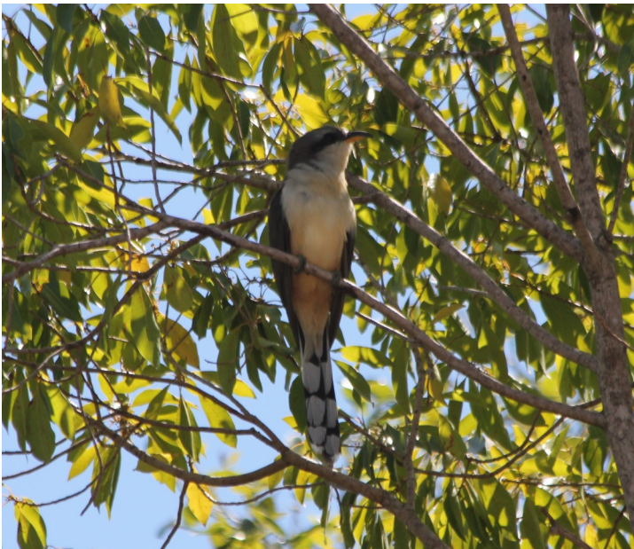
Mangrove Cuckoo.

Many of the parrot species are becoming established but have not yet been voted in. So we decided to take some time to document all of the species we encountered, filing them away in the expectation that they will be voted in someday soon. The Scaly-breasted Munia and Mitred Parakeet fell into this category.