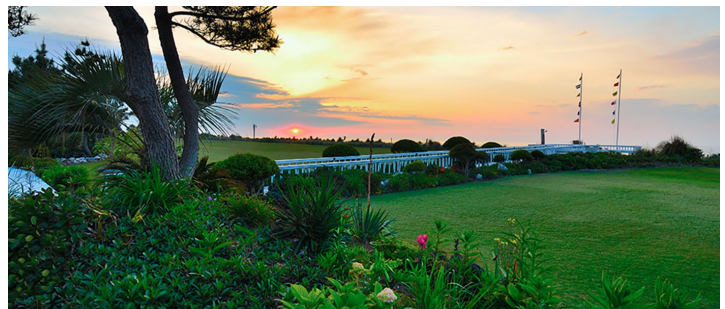
Gardens at Blockade Runner Beach Resort

Look for registration information and trip descriptions in the December CBC Newsletter and on our web-site: www.carolinabirdclub.org .