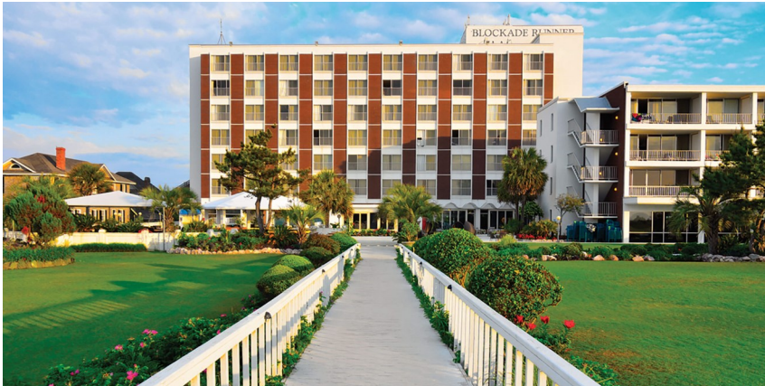
Blockade Runner Beach Resort on Wrightsville Beach

Our meeting site headquarters and host hotel is the Blockade Runner Beach Resort on Wrightsville Beach.