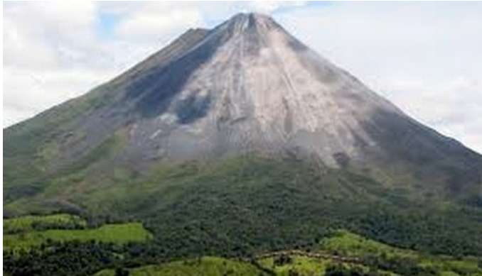
Arenal Volcano, Costa Rica

Carolina Bird Club is Offering 2 Bonus Trips to Costa Rica in February of 2018.