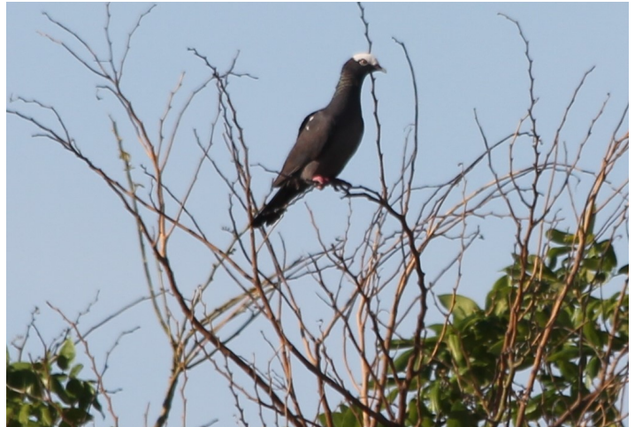
White-crowned Pigeon.

My potential life list target list was 35, but this included a lot of West Indian strays. I hoped for at least 11 life birds to bring my American Birding Association (ABA) area total to 600. It turned out I got all of my target birds and added four rare birds, the most unusual the ABA category 5 Bahama Woodstar hummingbird. We saw about 145 species total and I saw 17 (!) ABA life birds, photographing all but the Red-footed Booby seen at a distance from the parapet of Fort Jefferson.