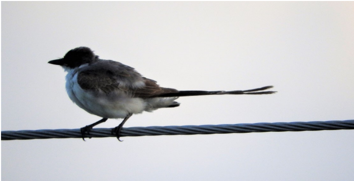
Forked-tail Flycatcher.

Various lakes yielded Snail Kite and Fulvous Whistling Duck, and the Circle B Bar Preserve was visited on a hot tip that a Ruff was there. We did see the Ruff and found the preserve full of very approachable waders like Limpkin and Roseate Spoonbill. It was our best photo spot of the trip.