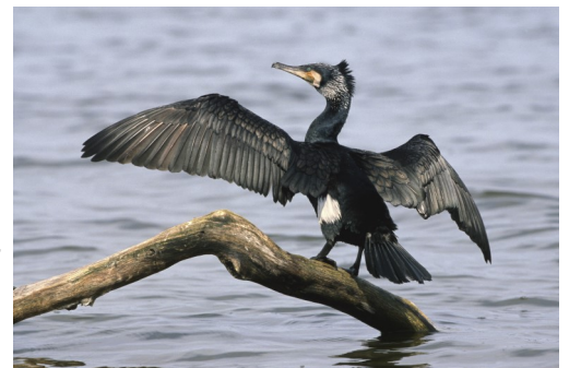
Great Cormorant.

CBC Newsletter (USPS 023:534), October 2017, Volume 63, Number 5. Published bimonthly by the Carolina Bird Club, Inc., 9 Quincy Place, Pinehurst, NC 28374. POSTMASTER: Send address changes to CBC Newsletter , Carolina Bird Club, Inc., 9 Quincy Place, Pinehurst, NC 28374.