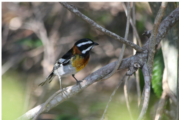
Western Spindalis.

We got a good close-up look in a few minutes on Key Largo. After that we got looks at the rather common Black-whiskered Vireo.