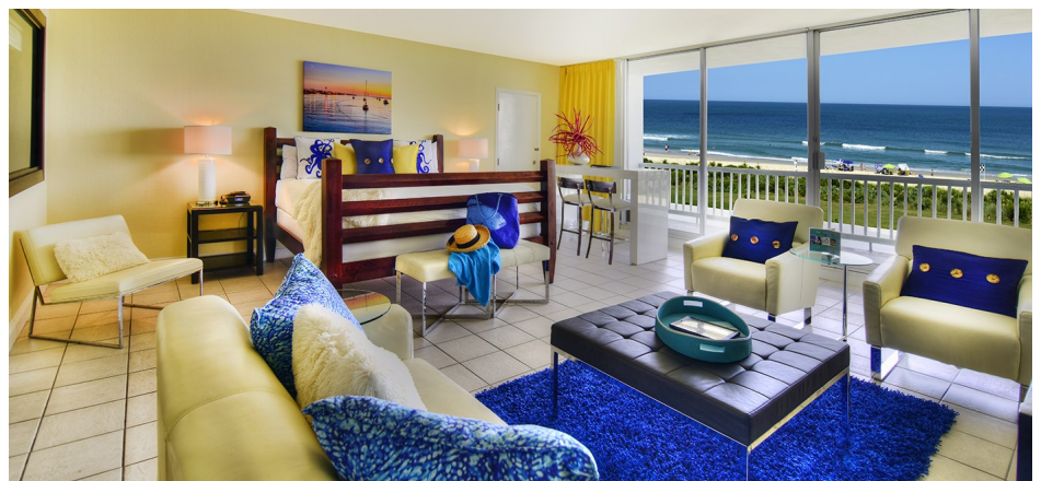
Blockade Runner Beach Resort on Wrightsville Beach Ocean View Room

For reservations call 910-256-2251 and make sure to tell them you are with the Carolina Bird Club.