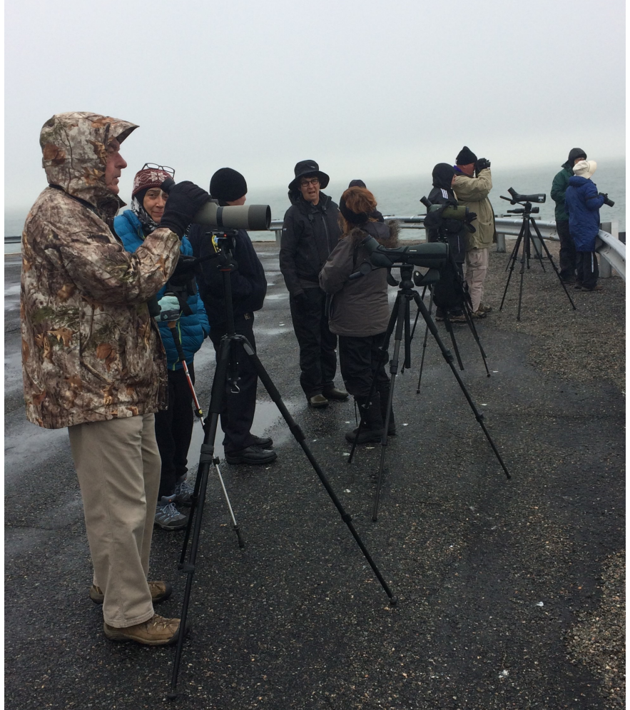
Birding on Chesapeake Bay Bridge Tunnel Island #3

After lunch we found our way through Mackay Island NWR toward the Currituck Ferry, spotting American Bittern in the roadside ditch, Snow Geese and Tundra Swans in the sound, and ducks flying by in neat chevrons. Again non-birdlife tried to steal the show as we found a gorgeous Coastal Plains Milk Snake on the 0.3 mile loop trail at the south end of the "big causeway" in Mackay. The snake allowed for brief handling and an impromptu photo session.