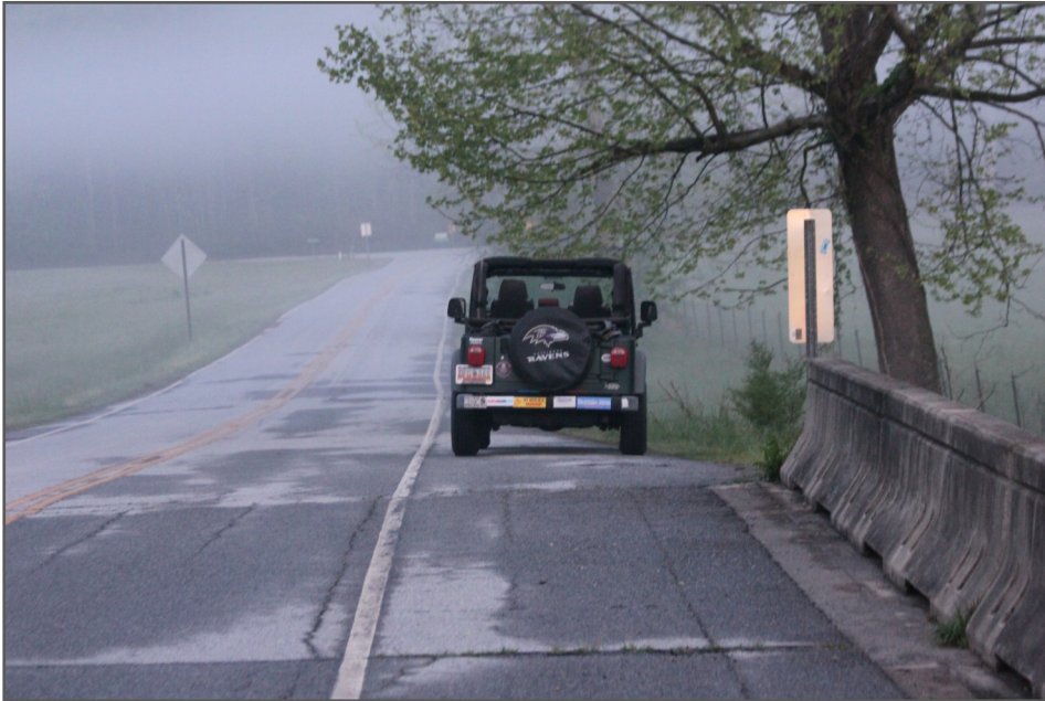
The Bridge at Dawn

For an excellent Spring birding spot, try the bridge at the Eastatoe Creek in Pickens County. I visited there April 21, arriving at pre-dawn.