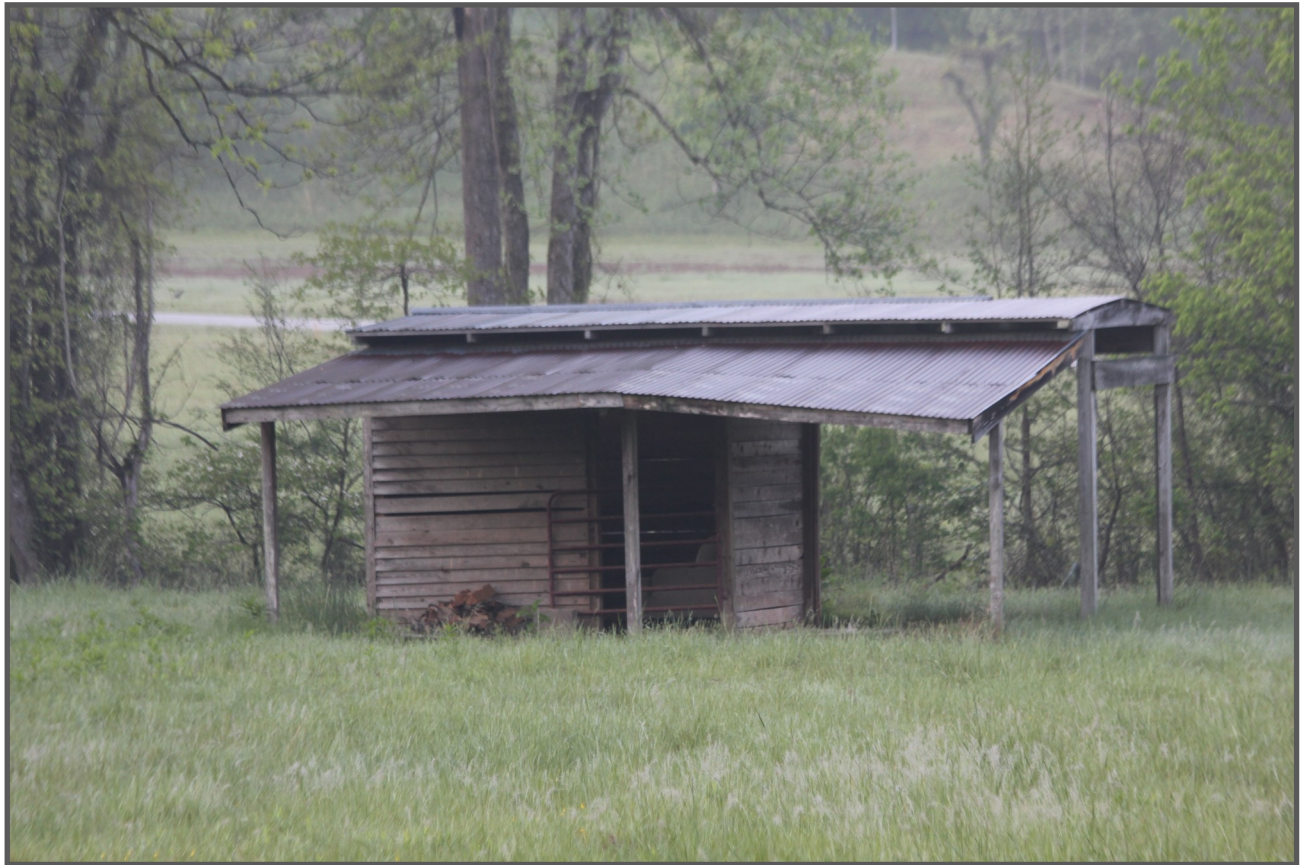
Farm Shed Near the Bridge

You can combine a visit to this site with a trip to the summit of Sassafras Mountain further up 178, or cross Highway 11, taking Eastatoe Creek Road to E. Preston McDaniel Road to the Nine Times Preserve.