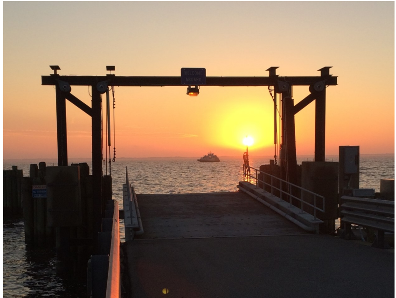
Knotts Island Sunset

Sunday started at Jeanette's Pier where once again three Common Eider put on a show. Interestingly these were not the same eiders as the prior weekend (2 females and 1 immature male versus 2 immature males and a female earlier). The eiders fed on small, white silver dollar-sized crabs, and paid zero attention to the surfers paddling out with a few yards of their activity.