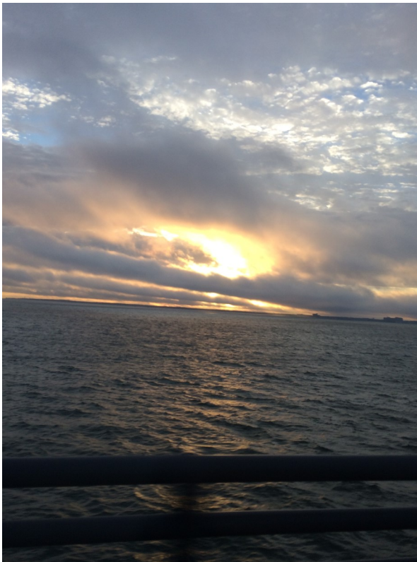
Cold front blows across Chesapeake Bay

The eiders were as close as ten yards to shore. The pier also hosted the continuing Black Scoters, with adult male, immature male, and female feeding directly below us and posing nicely for photos.