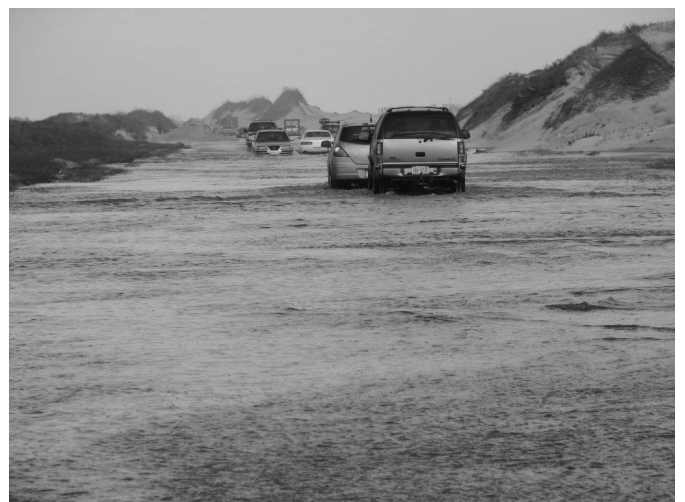
Vehicles traverse a flooded section of NC12 at Pea Island

If you have not attended a Wings Over Water, November 2011 will give you another chance (and chances are good that that roads will be above the high tide line!)