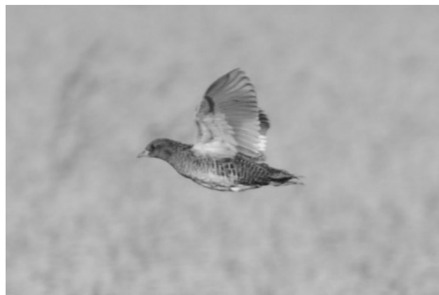
Yellow Rail at the 2010 Festival Donna L. Dittmann

rice, while at other times the birds would fly into the stubble, offering a tantalizing chance for birders to get a look at a non-moving rail, and maybe even snap that prized photo. But even in four-inch rice stubble, a Yellow Rail can disappear quickly. Each strip of rice cut left less and less un-harvested crop, and in each paddy, the last cut was always watched with great expectation. How many rails were corralled into this last bit of tall rice? Sometimes the combine would finish out the field with few birds flying from that last cut, but on one occasion we had more than half a dozen Yellow Rails fly out of the rice.