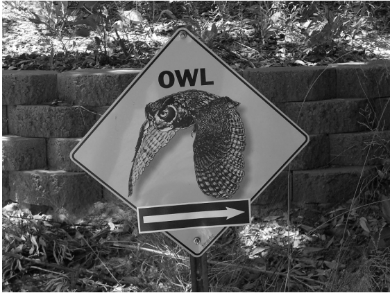
Arizona is "birder friendly"!

In late May and early June a group of CBC'ers visited Southeastern Arizona on the "A Taste of Arizona!" bonus trip. With close to 150 species of birds seen (as well as Tiger Rattlesnake, Gila Monster, and exceptional scenery) participants had a chance to sample the birdlife of the "Sky Islands" and enjoy the varied habitats as we birded from the Sonoran Desert lowlands to the pine-studded mountain tops. Look for a write-up of the trip in the next issue of the Newsletter. Until then, enjoy some scenes from Arizona!