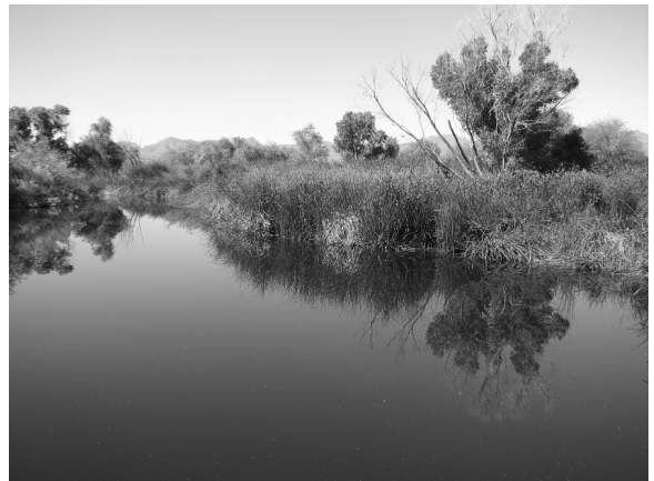
Sweetwater Wetlands in Tucson