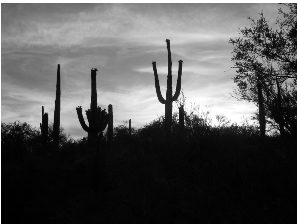
Saguaro National Park