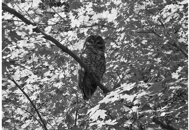
Spotted Owl, Miller Canyon, Huachuca Mountains