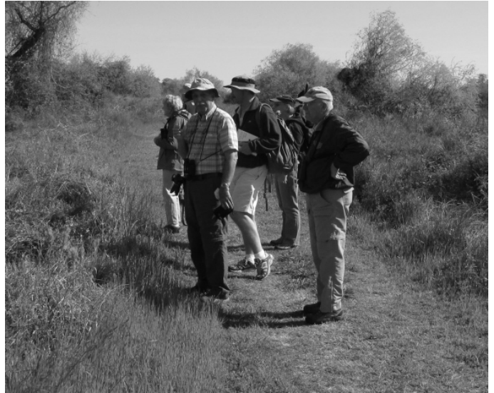
Birding the Coastal Texas Brushlands

Kiskadee and Couch's Kingbird. Leaving Pollywog after a full day, we were rewarded nearby by the grub dished out (as well as the generous happy hour) at Peoples Restaurant.