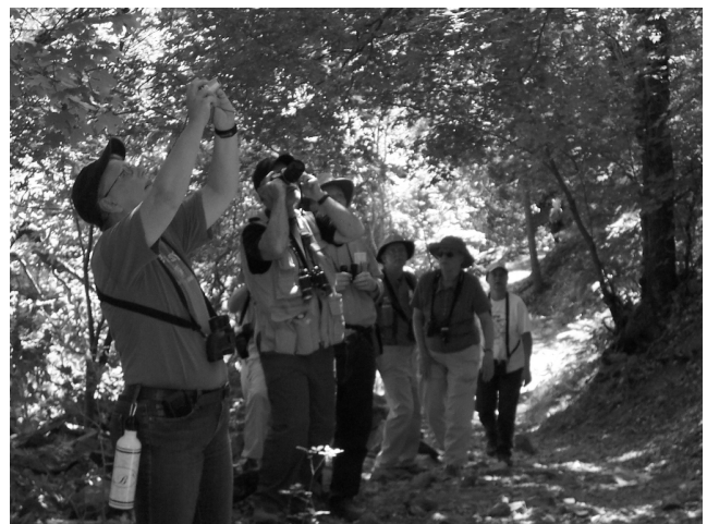
Enjoying the Spotted Owl in Miller Canyon