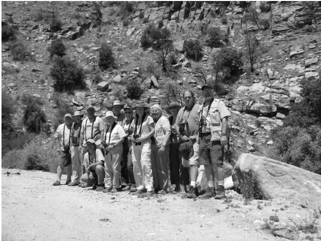
The group in the Santa Catalina Mountains