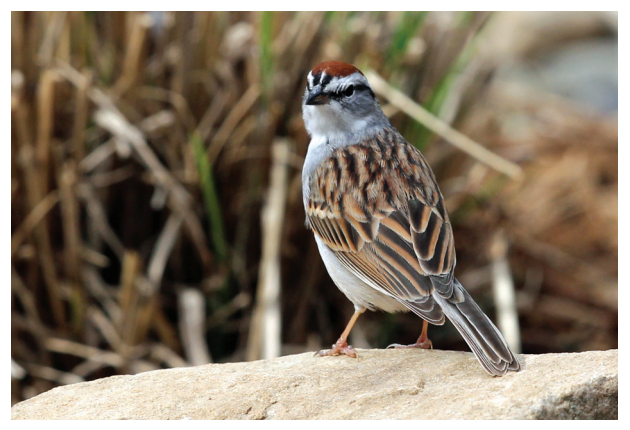
Chipping Sparrow. (Jim Guyton)

The Chipping Sparrow is a prolific breeder that regularly has two and sometimes three broods during a single breeding season. Some Piedmont observers reported watching the male finish provisioning insects to nestlings at one nest while the female was already off building and laying eggs in another nest. However, there is usually a delay of a few days. Nests are often located in easy to observe locations near homes or in shrubbery beside office buildings, at golf courses, at parks, and along greenways. As such, these birds often fall prey to feral or outdoor house cats. The average clutch size is four eggs. Around the turn of the twentieth century, many of these nests were lined with horsehair. After the development of the automobile but before the age of air conditioning, many Chipping Sparrow nests discovered in yards were lined with human hair gathered from outside of a bedroom window.