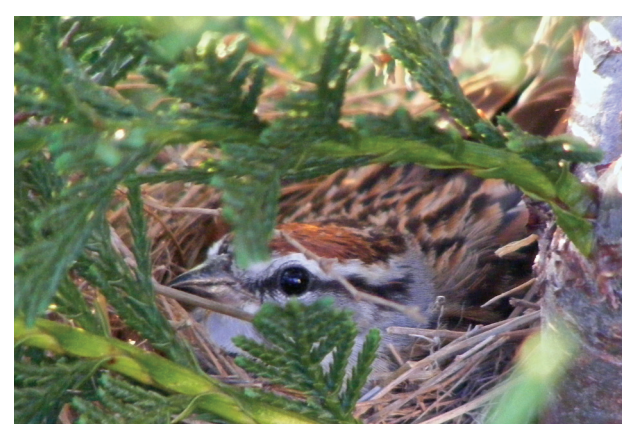
Chipping Sparrow on nest.