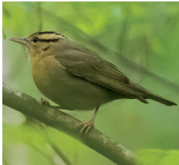
Worm-eating Warbler.