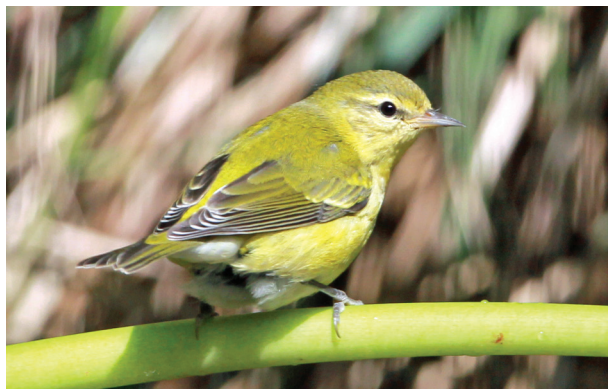
Tennessee Warbler.

Loomis collected a single specimen of this species