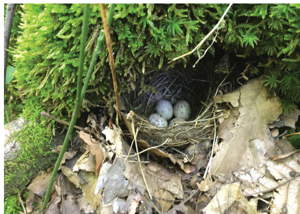
Nest at Latta Plantation NP. (Christine Lawson)