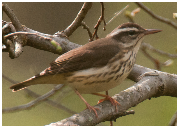
Louisiana Waterthrush.

Had my first (and first ever in February) Louisiana Waterthrush of the spring at McDowell Nature Preserve, near the parking lot for the Four Seasons