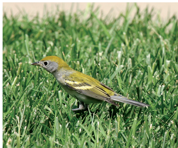
Chestnut-sided Warbler in fall.

Stephen Thomas photographed an injured Chestnut-sided Warbler on September 5, 2007, foraging in the grass along a sidewalk in downtown Charlotte. The bird appeared to have hit a building while it was migrating over the city the night before.