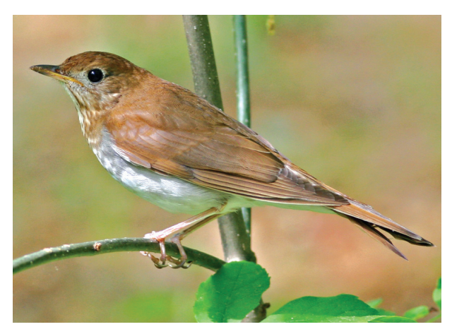
Veery at Latta Park in Charlotte.