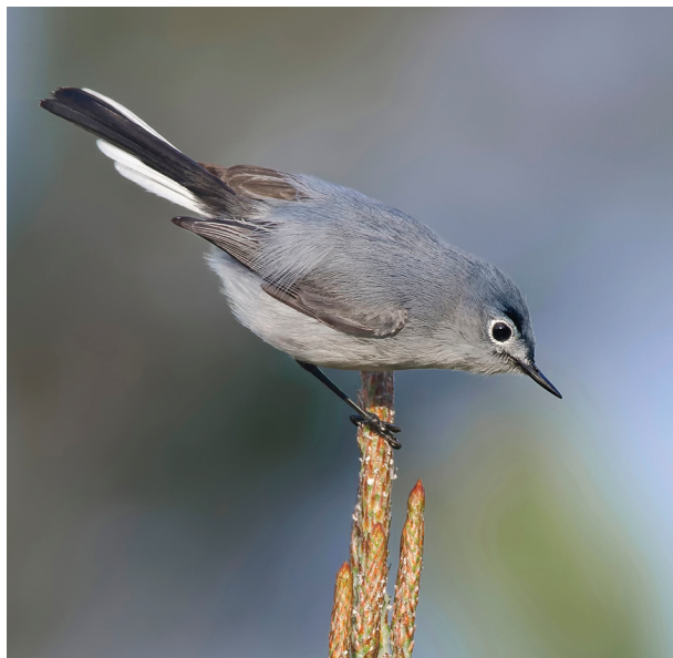
Blue-gray Gnatcatcher.

The Gnatcatcher is one of the first birds to nest in the spring. He nests in early April. ... They come to us in early March and may be found around our cemetery [Oakwood] late in February or March. ... He builds his nest fifteen or twenty feet high on branches of trees. He is a gentle and confiding in his manner and builds within easy reach of the eye. His building season is in the early spring when the tree leaves are no larger than a squirrel's ear, for this reason his nest may be clearly observed. He does not mind observation. He is a nervous bird, but not shy and is gentle.